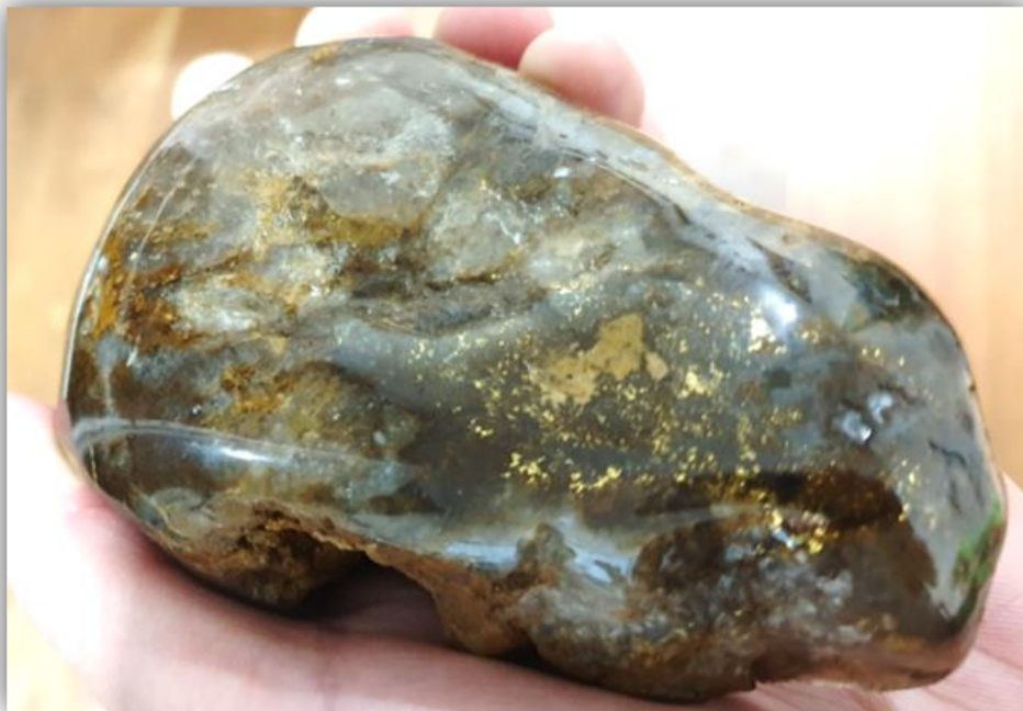
Figure 2: Photograph of polished gossanous quartz vein with abundant visible gold recently sampled by the Company from the outcrop exposures in the north face of the Brians historic pit.

Due diligence work by SCI includes a highlight discovery of quartz veins within the Brians prospect pit displaying abundant visible gold (Figure 2) that has not been followed up properly with drilling. For more details on the Austin Gold Project, including several new high-grade assays on rock samples and previous drilling intersections that have never been followed up refer to SCI announcements dated 7 th , 12 th and 19 th April 2021.