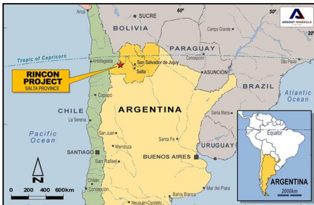
Argosy Minerals Limited – Rincon Lithium Project Location Map

Subsequent to the reporting period, the Company received formal confirmation from the Ministry of Mines and Energy in Namibia that the tenement (EPL 4079) comprising the Erongo Project had been fully relinquished.