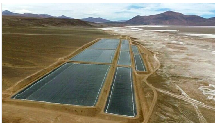
Rincon Lithium Project – current Stage 2 Evaporation Ponds

The Company commenced two concurrent phases of drilling operations – resource exploration drilling utilised a diamond drill rig to collect drill cores for porosity assessment and to obtain brine samples for resource estimation, and production well drilling using a rotary drill rig for construction of wells for pumping of lithium brine into the Stage 2 evaporation ponds.