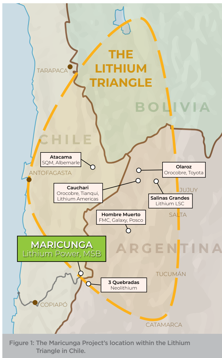
Figure 1: The Maricunga Project's location within the Lithium Triangle in Chile.

The consolidation of the mining concessions under the joint venture, would also provide the opportunity to increase production capacity and/or extend the life of the mine beyond its expected 20-year span, therefore creating additional value for all shareholders. This is in addition to the likely added resource at depth on the MSB tenements yet to be assessed.