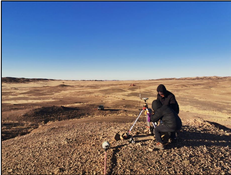
Figure 2: Field work at Bronze Fox