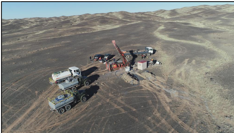
Figure 1: Drilling at Bronze Fox

Assays for the program are expected to be available in late December 2024 or early January 2025. Woomera can earn an 80% interest in the Bronze Fox Project from Kincora Copper Limited (ASX: KCC) by expenditure of US$4m and has the right to acquire a 100% interest.