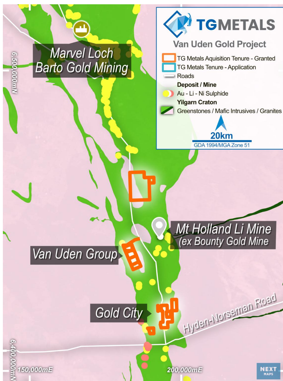
Figure 4 – Location Map showing TG Metals' Van Uden Gold Project

Van Uden Gold consists of four granted mining leases, four granted exploration licences, one exploration licence application and two miscellaneous licences (for haul roads). The Project lies to the west of the Mt Holland lithium mine, south of the operating Marvel Loch gold Plant, and southeast of the Edna May gold Plant.