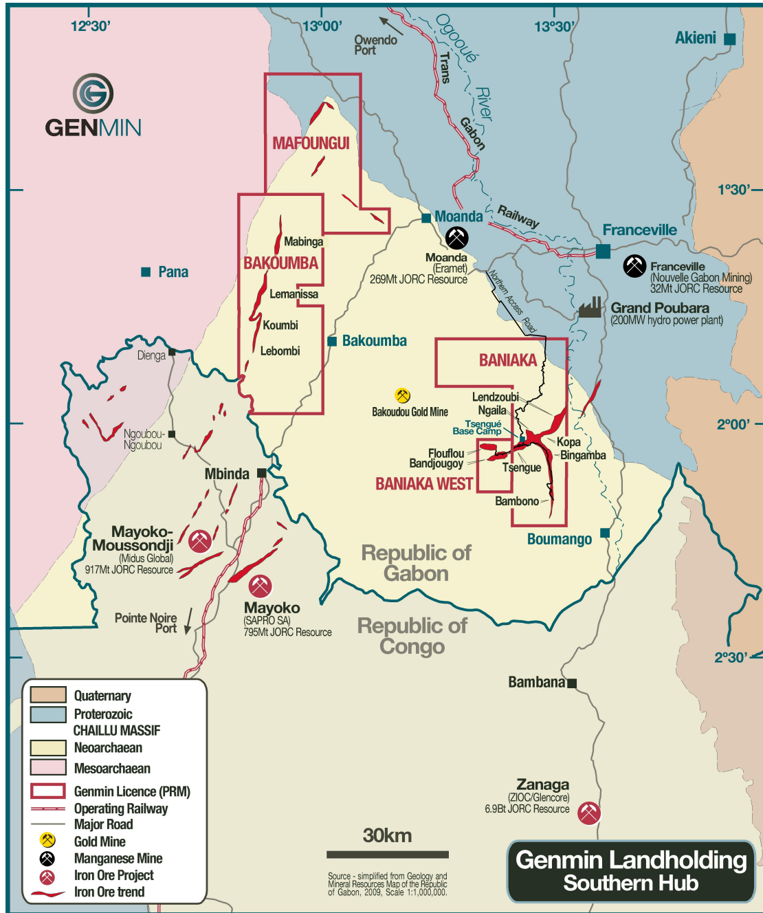
Figure 2: Genmin project location, southeast Gabon