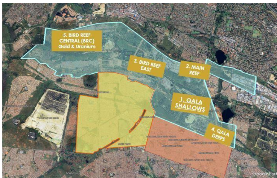
IMAGE 1: WBP: MINING RIGHT (BLUE); NEW PR GRANTED (YELLOW) & NEW PR APPLICATION (RED)

Meanwhile, PR10839 has progressed, with the Environmental Authorisation successfully obtained, a smooth stakeholder engagement process with no objections or appeals, and the final reports submitted to the DMRE. The project is now awaiting formal granting by the DMRE.