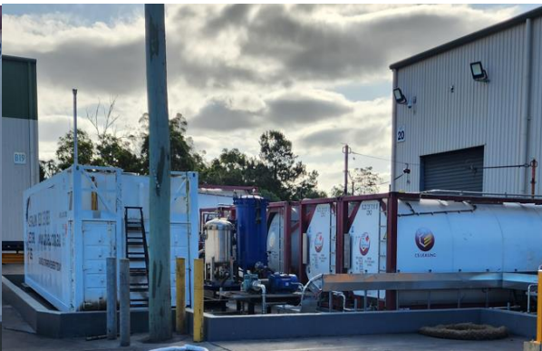
Image 3 and 4: Fuel management system installation on site at Stapylton