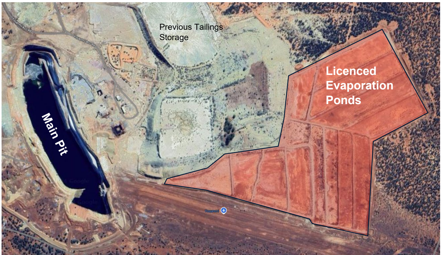
Figure 2: Plan view showing the location of dewatering infrastructure.

Works are well advanced on early dewatering with tenders received for the minor refurbishment works on the fully permitted evaporation ponds, along with quotes on the pumping infrastructure requirements. Environmental works have commenced to seek permitting for dewatering to the northern pits, accelerating the opportunity to access the lower areas of the main pit and the previous underground workings.