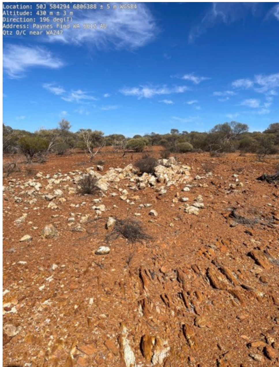
Figure 5: Strong shearing and quartz veining associated with the gold anomaly