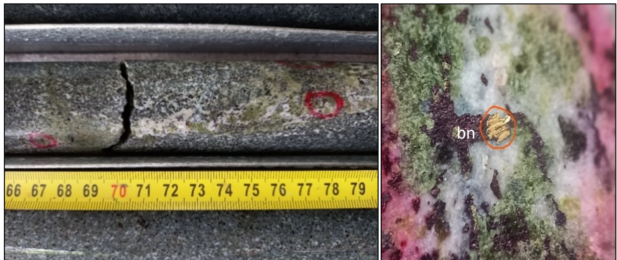
Figure 3: Photographs of the deep intercept from drill hole TUDDH494 at 1106 m depth that returned 12.2 g/t Au and 0.39% Cu hosted in a pervasively altered monzonite exhibiting an assemblage of epidote-actinolite?-orthoclase-biotite-magnetite-bornite and native gold forming an irregular band at low-angle to core axis.

Mineralized intercepts at 1106 m and 1192 m downhole depths in TUDDH494 re-entry hole, exhibit coexistence of visible gold, bornite, chalcopyrite and magnetite, developed in association with discrete bands to irregular anastomosing zones of pervasively developed epidote-orthoclase-magnetite-biotite-actinolite? alteration in monzonite. Multiple occurrences of minor ( <<1\% ) chalcopyrite and bornite without visible gold have also been documented to at least 1285 m downhole depth in TUDDH494. Although observations are still very preliminary in extent, if confirmed by additional drilling, the mineral assemblage described above suggests that the high-grade 500 Zone feeder may be rooted in a monzonite stock that is altered by a high-temperature magmatic-hydrothermal potassic to calc-potassic assemblage mineralized in both Au and Cu (Figure 3). Possible analogues to such mineralization include Newcrest's Ridgeway Au-Cu deposit in the Cadia Intrusive Complex, NSW, Australia, and Centerra's Mt. Milligan Au-Cu deposit, BC, Canada.