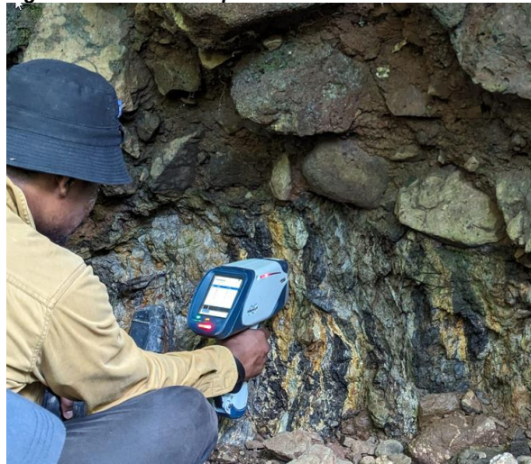
Figure 4 - Schist outcrop in river