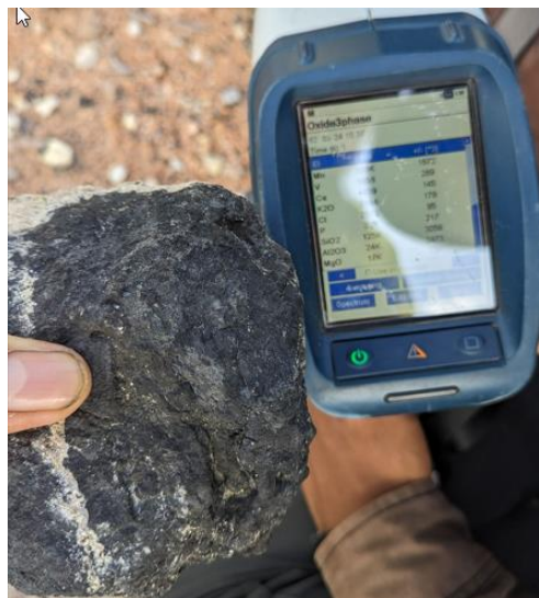
Figure 2 – Banded Mn ~10cm (LRG-031 returned 48.1% Mn from pXRF)