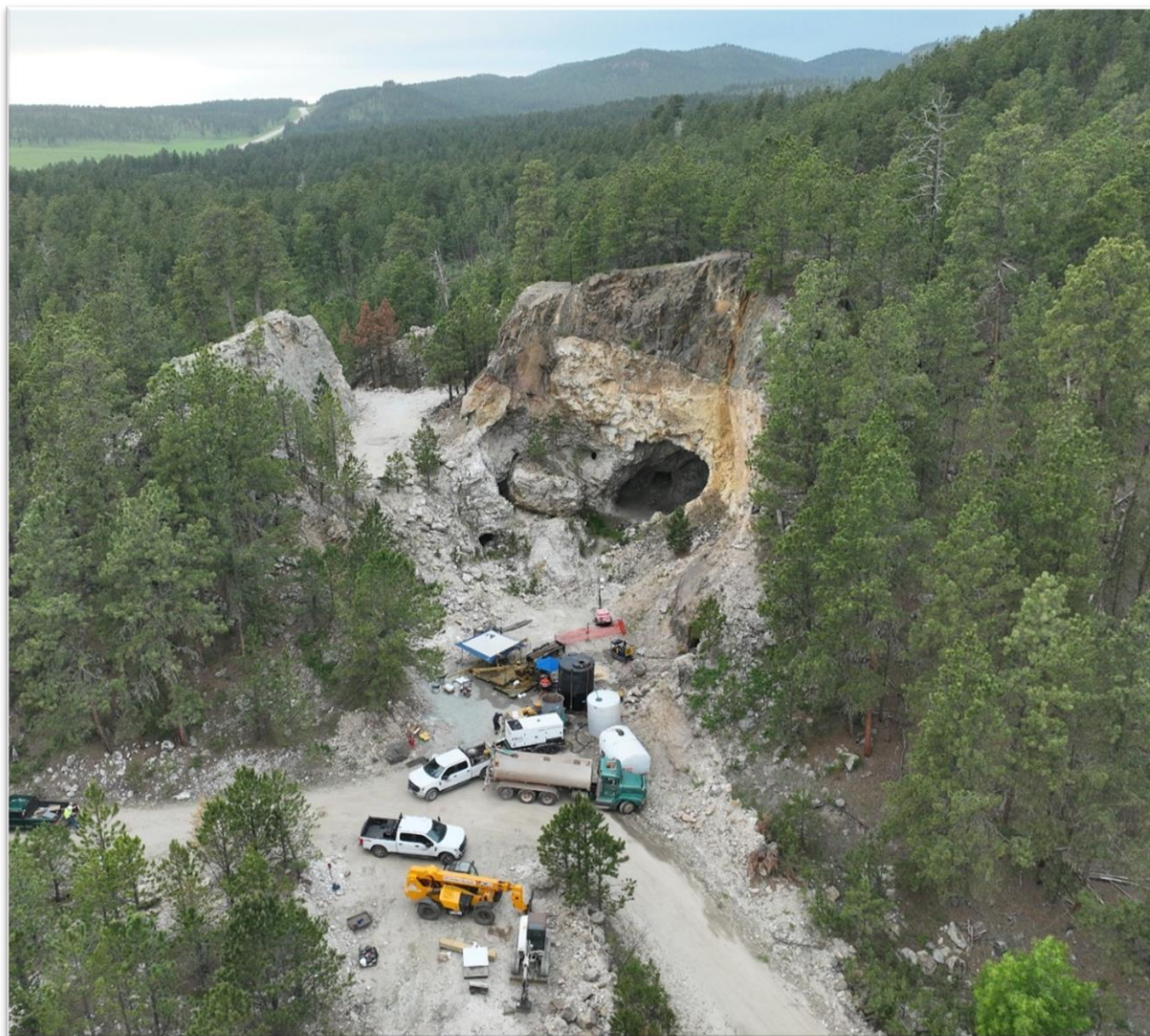
Figure 2: Phase II drilling operations at the Tin Mountain Project

Visual estimates of mineral abundance should never be considered a proxy or substitute for laboratory analyses where concentrations or grades are the factor of principal economic interest. Visual estimates also potentially provide no information regarding impurities or deleterious physical properties relevant to valuations.