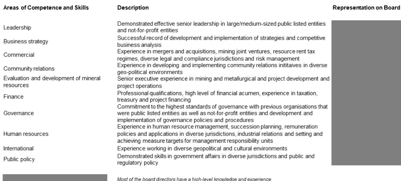
Table 2 Areas of Competence and Skills of the Board of Directors

The directors on the Board represent a diverse range of backgrounds as outlined in Table 2.