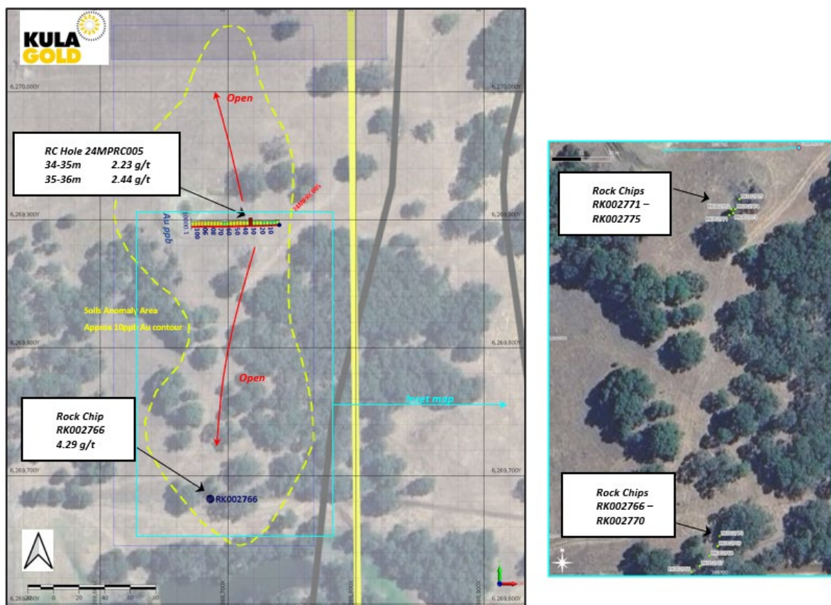
Figure 2: Mustang Prospect (Kula 100% for E70/6603) image with 20ppb UFF soil anomaly contour over satellite with drillhole 24MPRC005 trace and drill hole collar location and cross section A-B location labelled with insert with all rock chip locations. The polygon is based on Figure 2 ASX announcement dated 24 October 2024- EIS Co-Funding for Mustang Gold Prospect.

Independent GSWA review was completed and granted Kula the Western Australian Government's Exploration Incentive Scheme (EIS) 50% co-funding of direct drilling and mobilisation costs incurred up to $180,000.