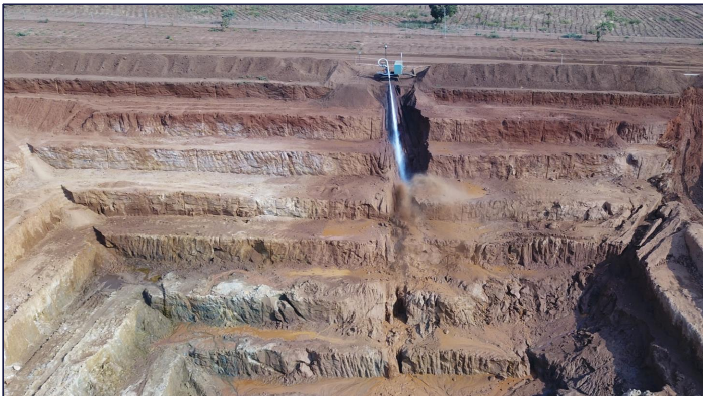
Figure 5: Hydraulic mined material (slurry) flowing freely to the collection point in the bottom of the sump

This water was used during the hydraulic mining trial and continuously recycled from the constructed holding cells, where sand and fine fractions are stored respectively prior to the planned deposition and rehabilitation testwork.