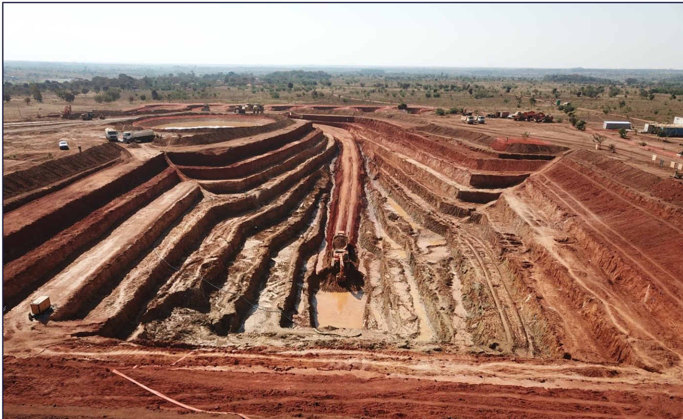
Figure 3: Kasiya Pilot Phase Test Pit mined to 20 metres depth

The saprolite-hosted mineralisation at Kasiya is largely homogenous and has relatively consistent physical properties throughout the 1.8 billion tonnes MRE that is reported in accordance with JORC (2012). Data collected from the pilot phase confirmed that no drilling, blasting, crushing, grinding or milling will be required prior to stockpiling material for processing into rutile and graphite products; an indication of potentially lower mining costs and a lower carbon footprint comparable to hard rock deposits.