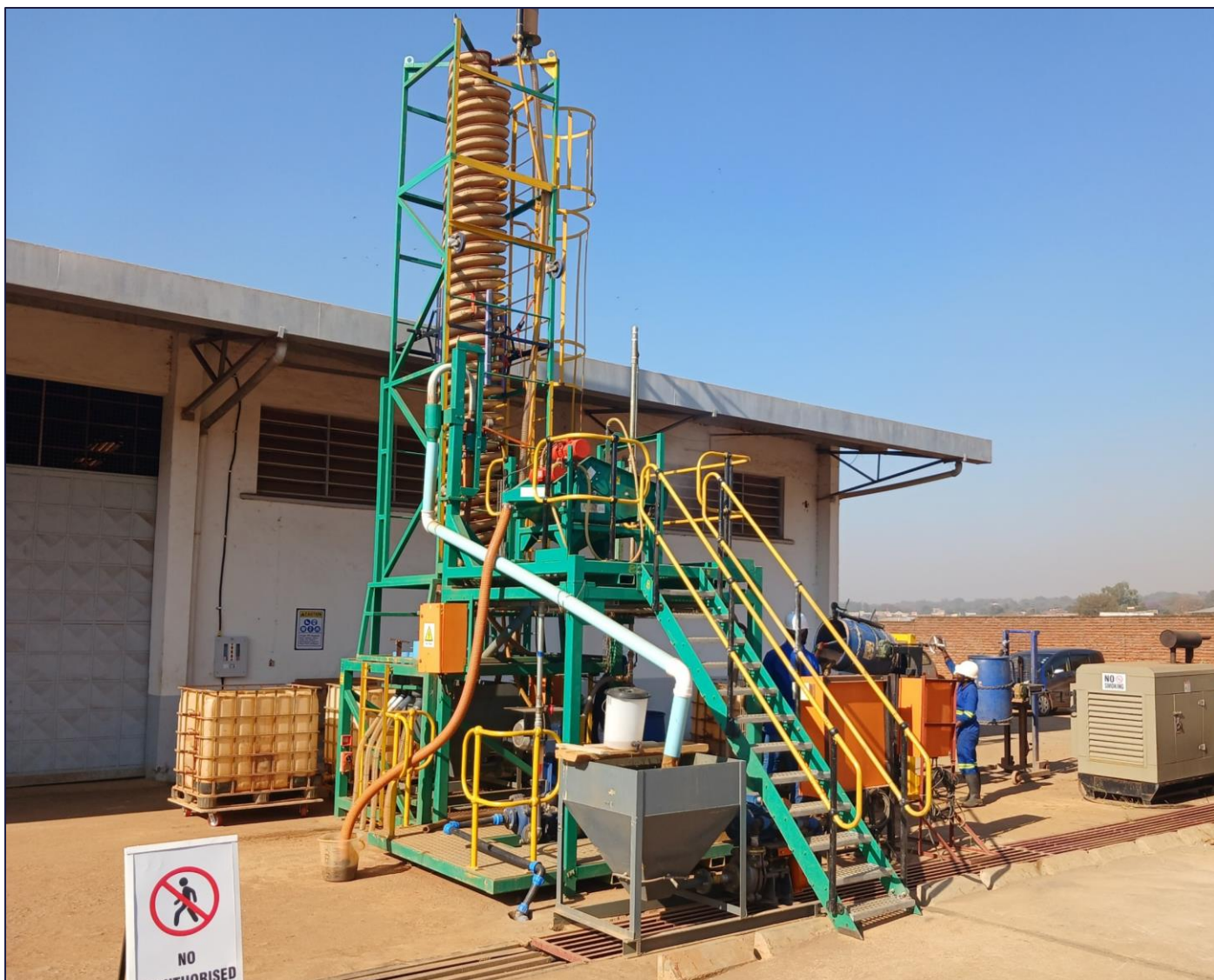
Figure 2: Spiral Plant installed at Sovereign's Lilongwe facility

The spiral plant will prepare a graphite gravity concentrate from the Pilot Phase test pit's run of mine at a bulk scale. The concentrate will then be sent to specialised laboratories where flotation, purification, spheronisation and coating testwork for the battery anode segment in line with Sovereign's strategy to commercialise Kasiya's graphite by-product. Graphite concentrate will also be provided to traditional industrial graphite users, including refractories and foundries, expandable graphite, graphite foil, brake lining pads, and lubrication.