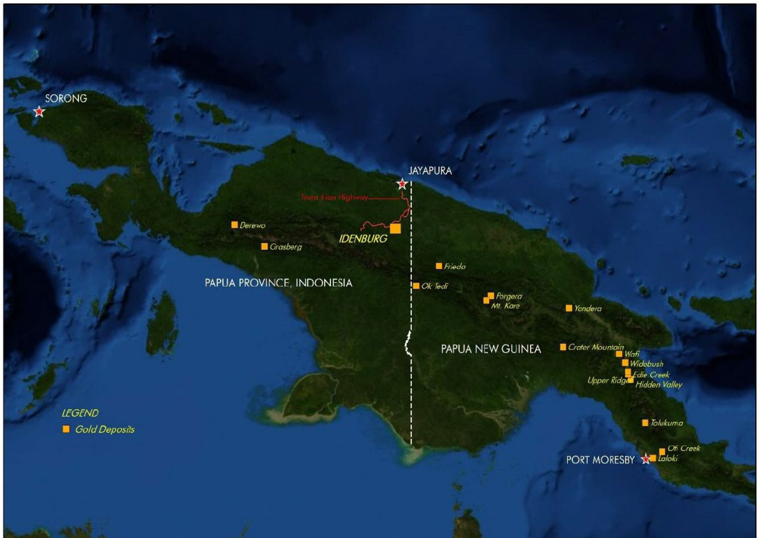
Figure 1: Map showing the location of the Idenburg COW in Papua Indonesia relative to the locations of world class multimillion ounce gold-rich porphyry copper deposits