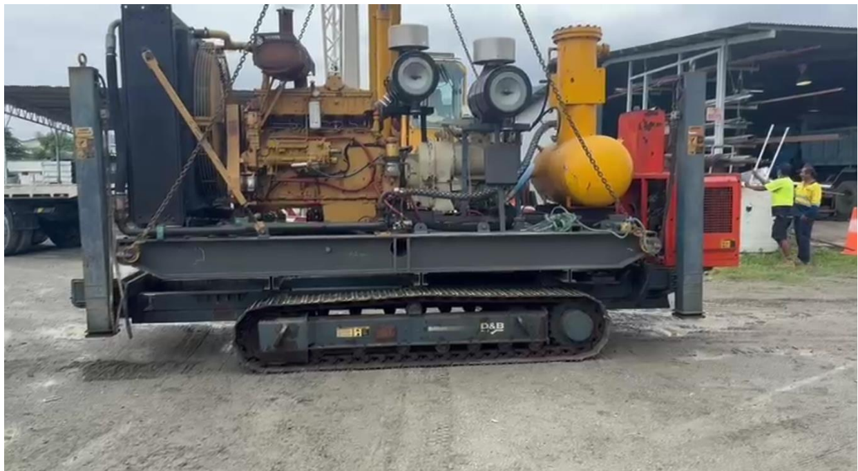
Figure 2: The Ingersol Rand 1070/350 compressor mounted on the additional track carrier.

Both the carriers and the drill rig are self-loading onto the back of a flatbed truck which enables fast mobilisation between drill lines and across the program in general. The front and rear jacks enable the gear to be stable when drilling in hilly terrain and also enable quick loading onto the back of a flatbed truck (pictured in Figure 1)