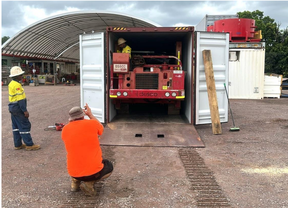
Figure 3: Rod slew carrier being loaded into one of four 40 foot sea containers ready to transport by ANL to the Dili Port

“The partnership between Estrella and CoreSearch is poised to make history, representing the first group to break ground in Timor-Leste following its adoption of a modern mining code.