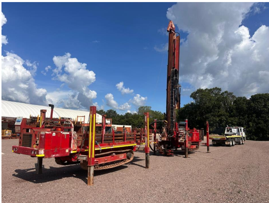
Figure 1: CoreSearch Rig 1 - SP6500 SA-RC-MP capable of both diamond and reverse circulation drilling along with one of two carriers containing two full rod strings and additional downhole equipment.