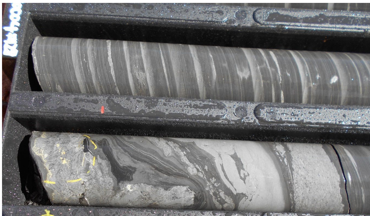
Below: Silicification associated with soft sediment deformation and sulphides.