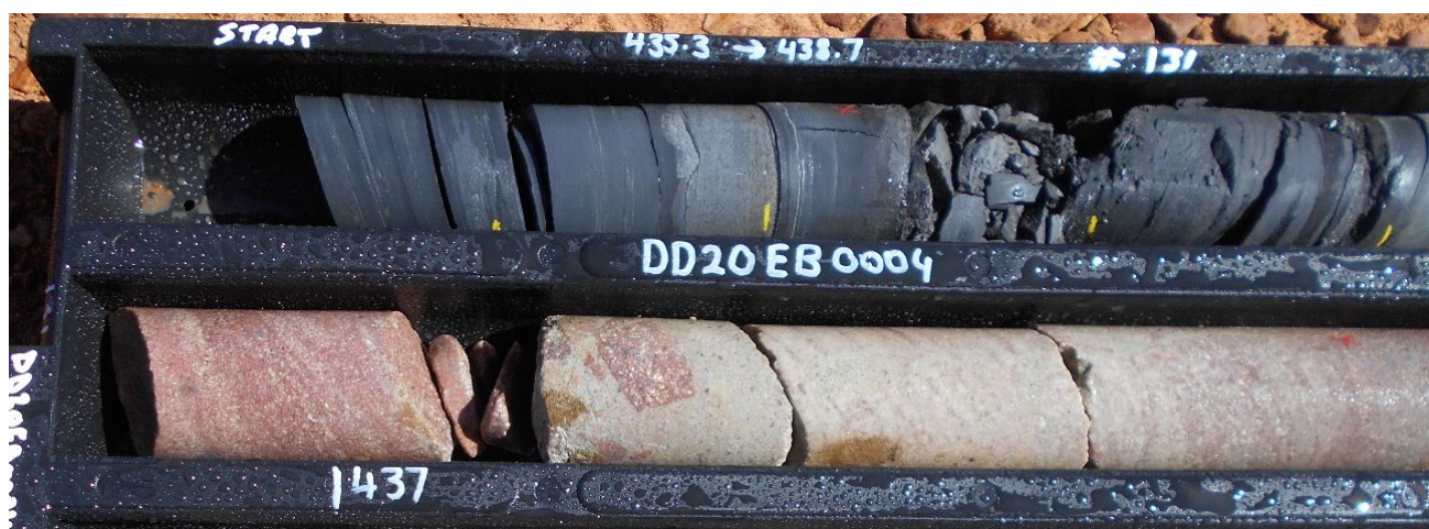
Above: Mineralised lower contact of the Tapley Hill Formation with the underlying Pandurra Formation.