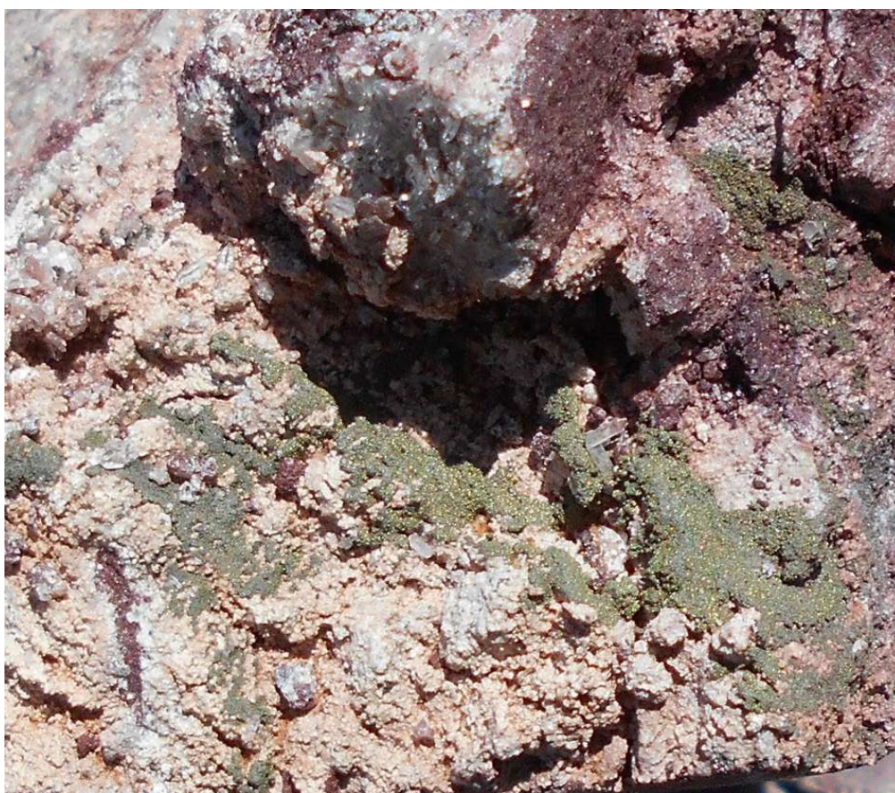
Above and Below: Copper sulphides are irregularly distributed through the breccia, and are most prominent in vugs, on fracture surfaces and associated with quartz veining.