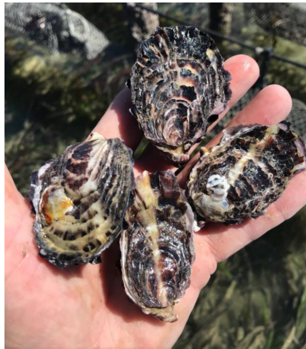
Below – Oysters almost ready for sale

On the 27 Feb 18 the Company announced the acquisition of a purpose-built export facility in Port Lincoln. The Company has now completed its legal due diligence on this facility and is awaiting final paperwork from the vendor to allow for a settlement in the near future.