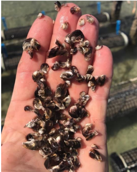
Left – Spat showing good growth at Cowell

Below are some photos taken during a grading operation at Cowell on the 10 March 2018.