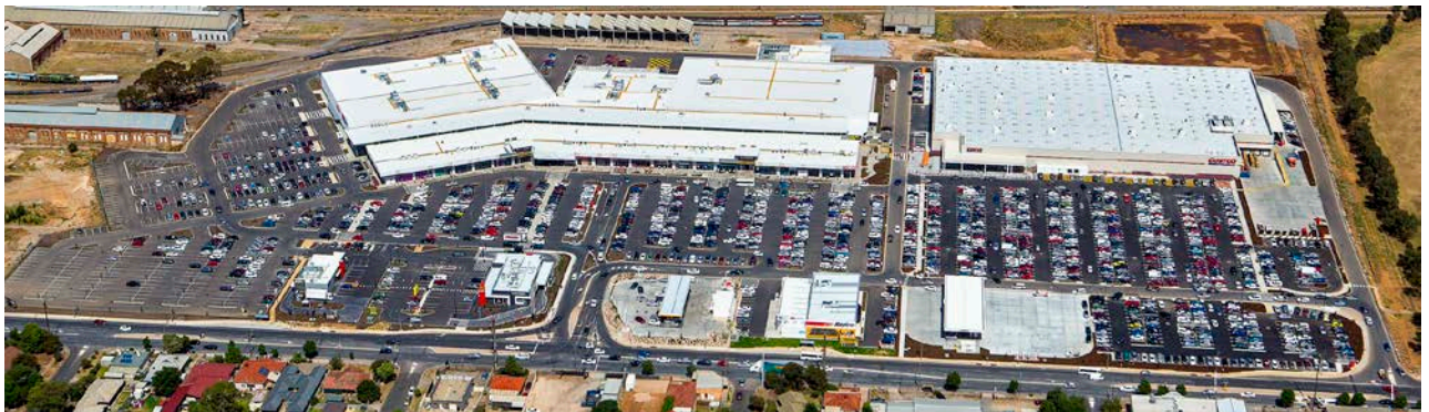
Churchill Centre North as at 19 November 2014