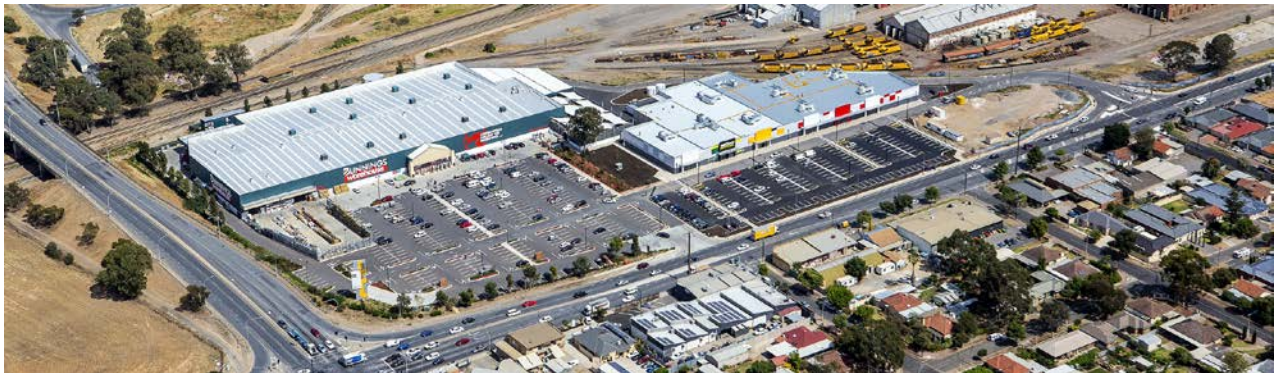
Churchill Centre South as at 19 November 2014