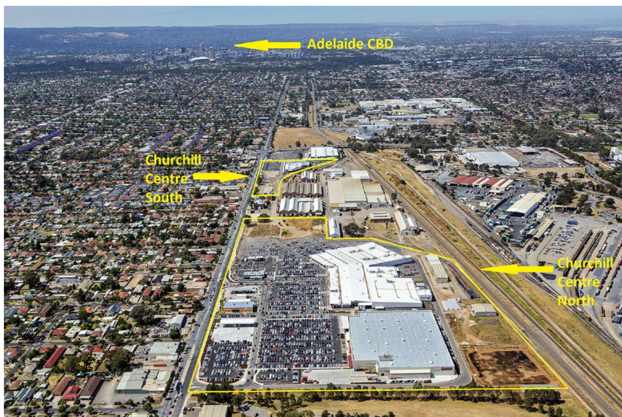
Churchill Centre North and South as at 19 November 2014

The Churchill Centre North component of this project sits on 18 hectares of land, and comprises a major sub-regional shopping centre, consisting of a 5,500 sq.m. Coles supermarket, a 5,400 sq.m. Kmart Discount Department Store, several other mini-major retailers and approximately 55 specialty shops. The Centre also incorporates a Coles service station alongside several other pad sites of fast food outlets incorporating McDonalds and KFC restaurants, and other strategic retailing uses, including Repco and a Kmart Tyre and Auto centre. In total, this northern stage is designed to incorporate in excess of 40,000 sqm of quality destination retail.