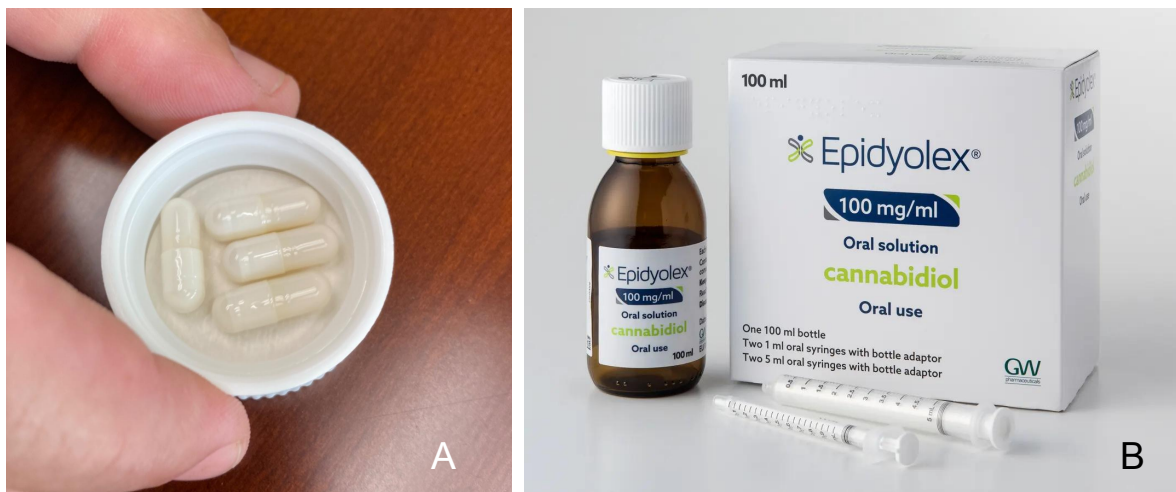
Figure 2: [A] EMD-RX5 “ultra-pure CBD” capsules and [B] Epidyolex CBD oil