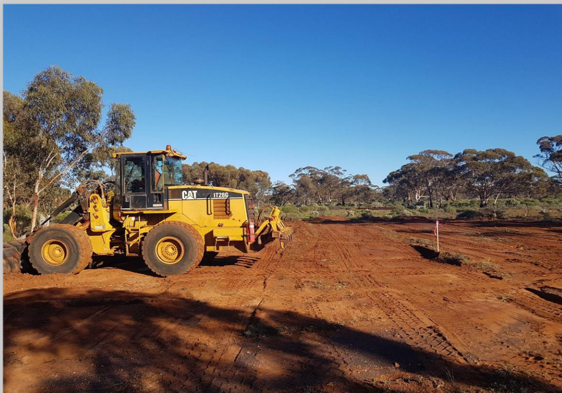
Figure 2: On-ground works for drill site preparation on the Avalon project.