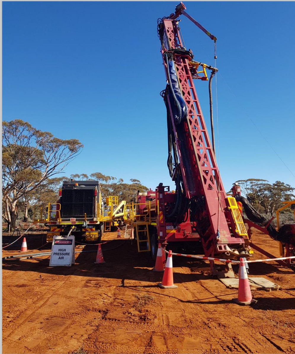
Figure 3: Drilling contractors mobilised to Avalon project.