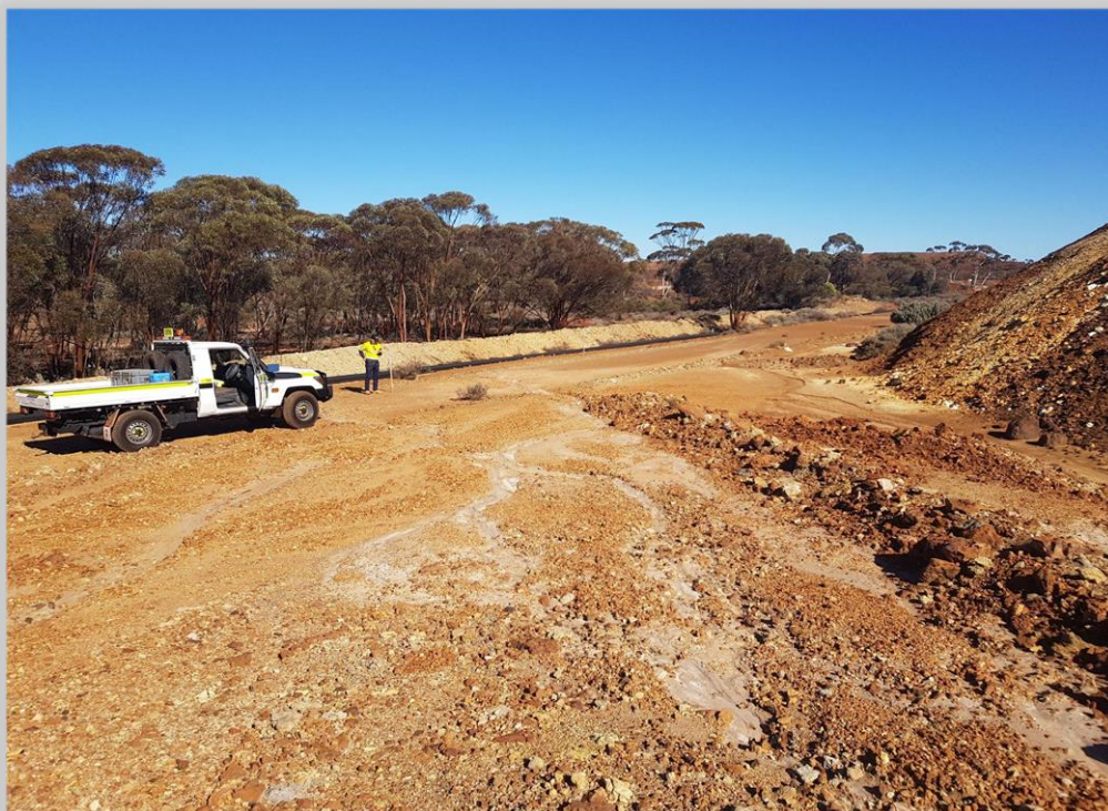
Figure 4: Top photo is of the historic Cawse Find gold pit and the below image is of field crews ground truthing and pegging out the planned drill sites.

This release is authorised by the Board of Directors.