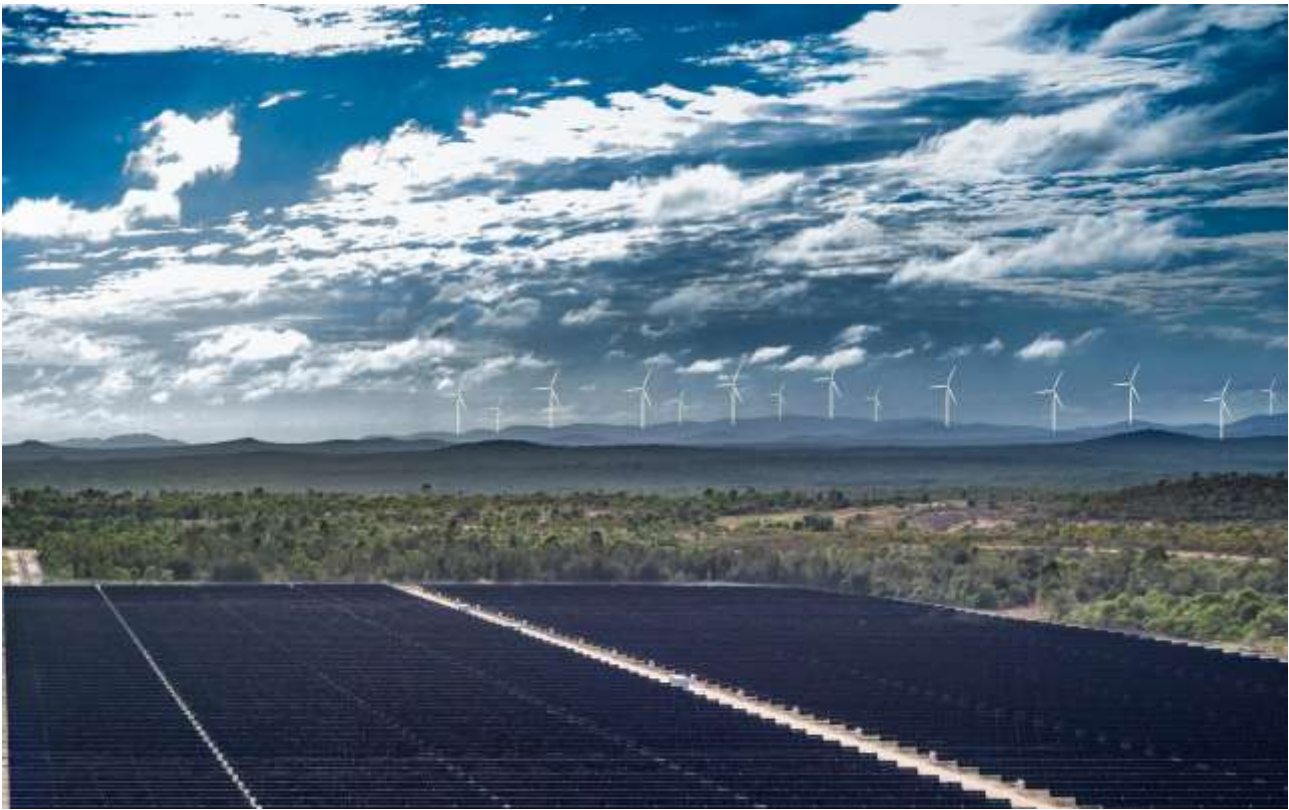
Figure 2: Artist's depiction of the K3-Wind Project at the Kidston Renewable Energy Hub.

The Federal Government, through the Australian Renewable Energy Agency ( ARENA ), has provided $8.9 million in funding to support the construction of Genex's KS1 Project, and up to $9 million in funding to support the development of K2-Solar and K2-Hydro.