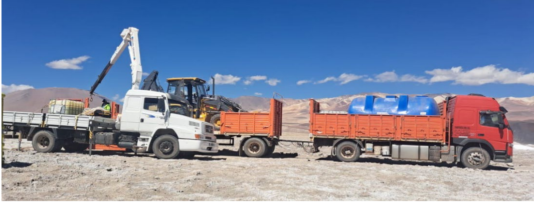
Figure 2 – Equipment trucks carrying front end loaders and initial drilling supplies arrive at Rio Grande Sur.

The drilling contractor and operations crew have mobilised, and pre-drilling preparations are underway with works including drilling platform construction as well as road clearing and construction currently being completed at both the Maria Magdalena and Sal Rio II tenements. The drilling crew and geological team are expected to mobilise in the current week to join the crew on site once camp preparations are complete. At this juncture, the drilling of DDH-1 at Maria Magdalena will commence.