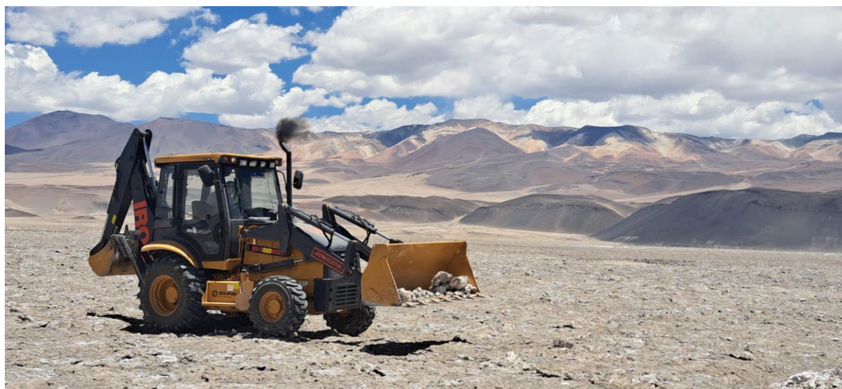
Figure 1 – Front end loader preparing roads and drilling platforms at the Rio Grande Sur Project in Salta, Argentina.

The initial phase of the drilling programme has now commenced on site at the Rio Grande Sur Project with earthworks and mobilisation of rigs underway.