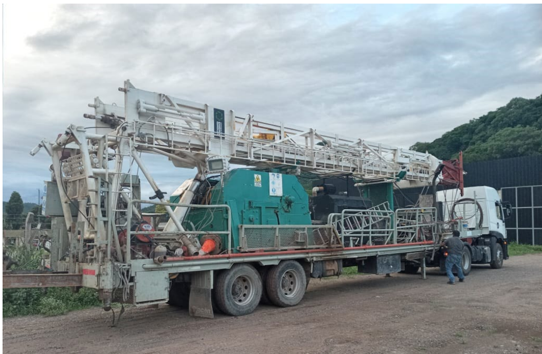
Figure 4 – Diamond Drill Rig being prepared at Pursuit's warehouse facility in Salta.