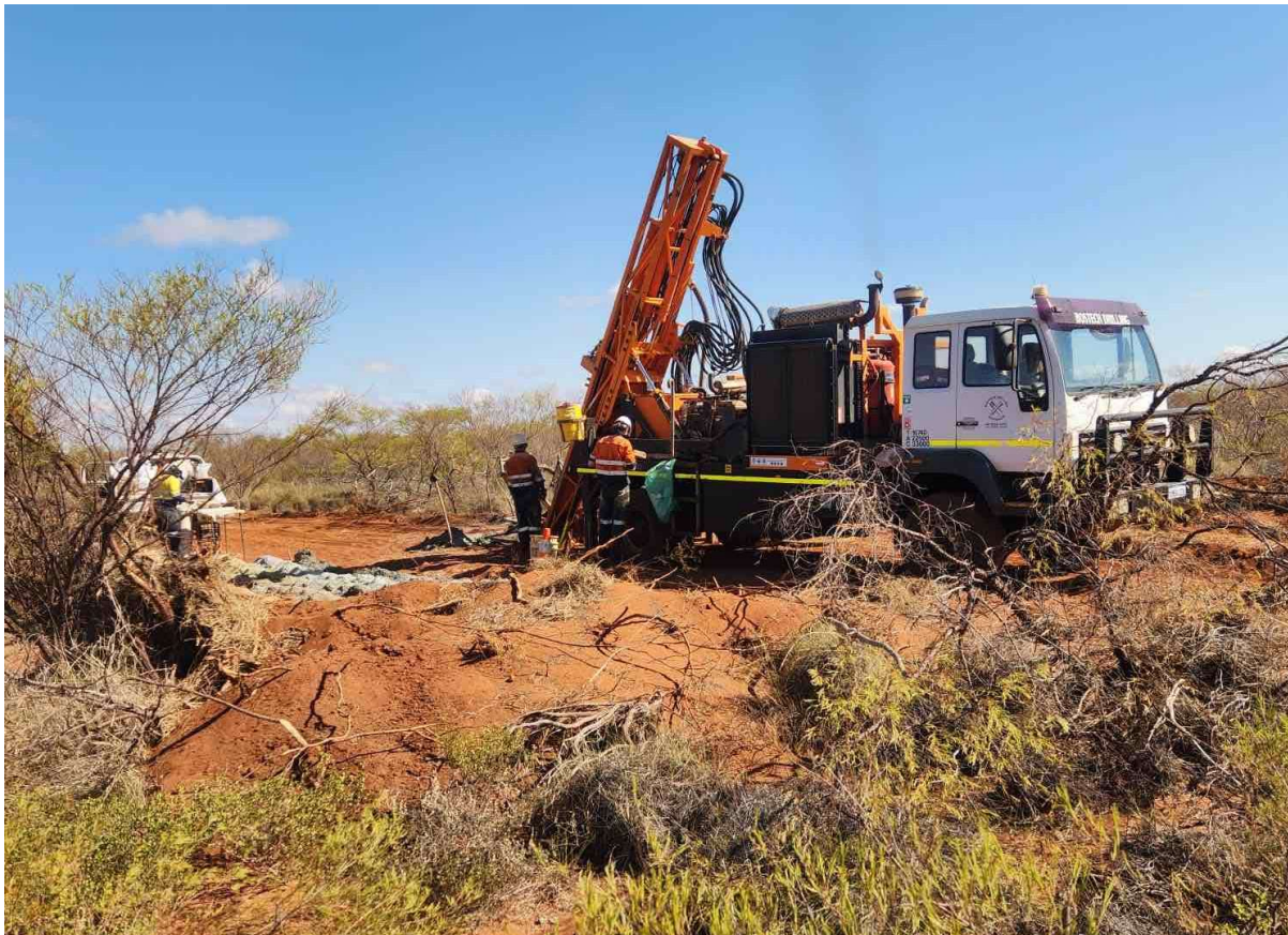
Figure 1: Drill Rig at Mt Berghaus

Mantle Minerals Limited (ASX:MTL) ("the Company") is pleased to announce that drilling has commenced at the Mt Berghaus tenements.