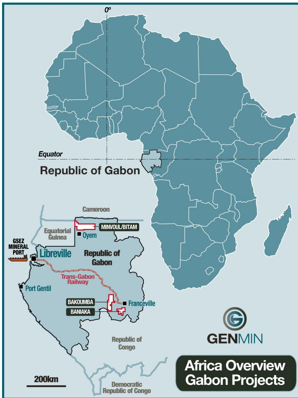
Figure 1: Location Map of the Republic of Gabon and Genmin's Gabon Projects