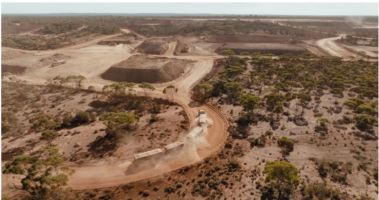
Figure 2: Ore Stockpiles on West ROM at Boorara

A further mining and processing update is expected in the Company's March Quarterly Report.