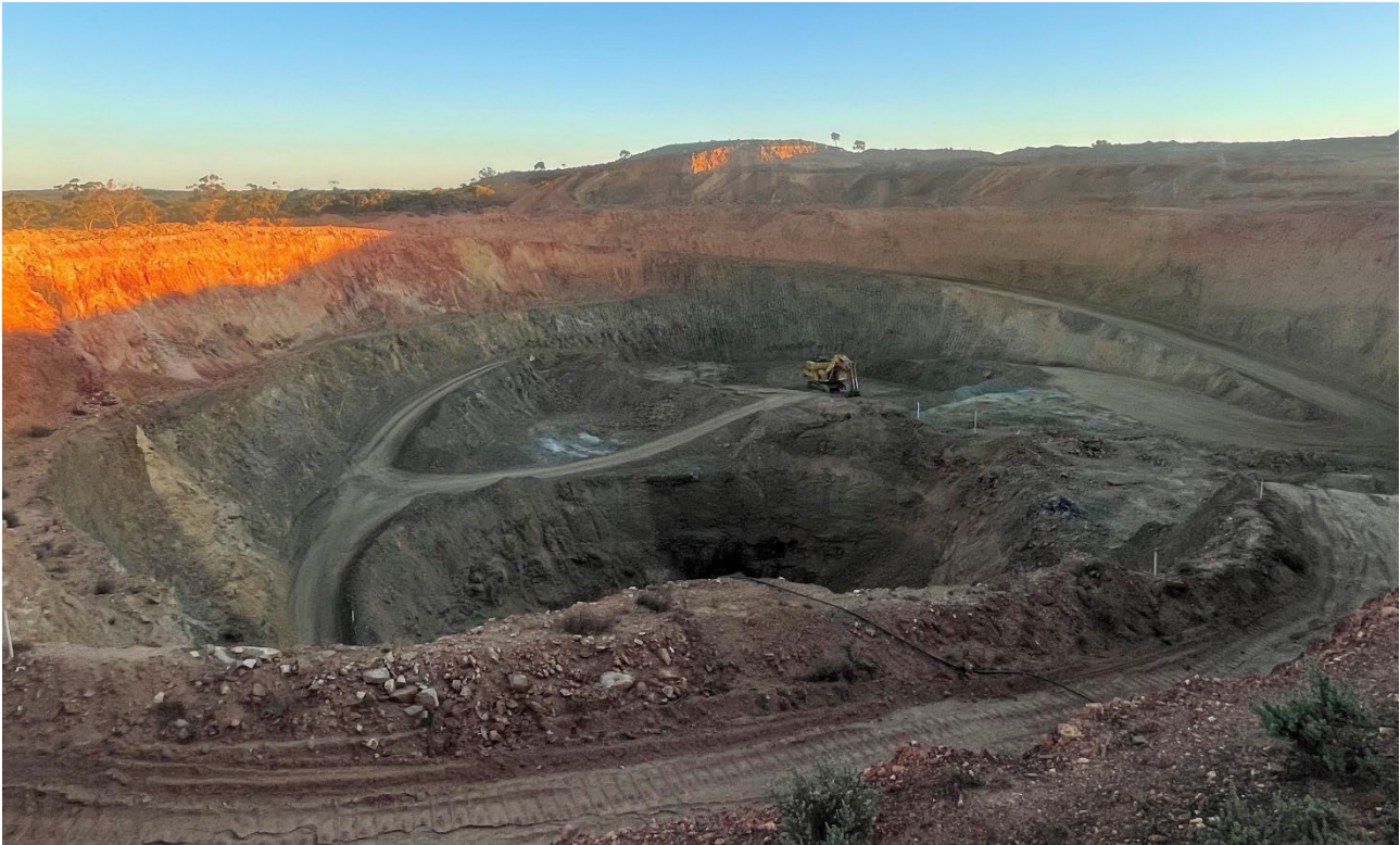
Figure 5: Mining the Newminster pit at Phillips Find

Authorised for release by the Board of Directors