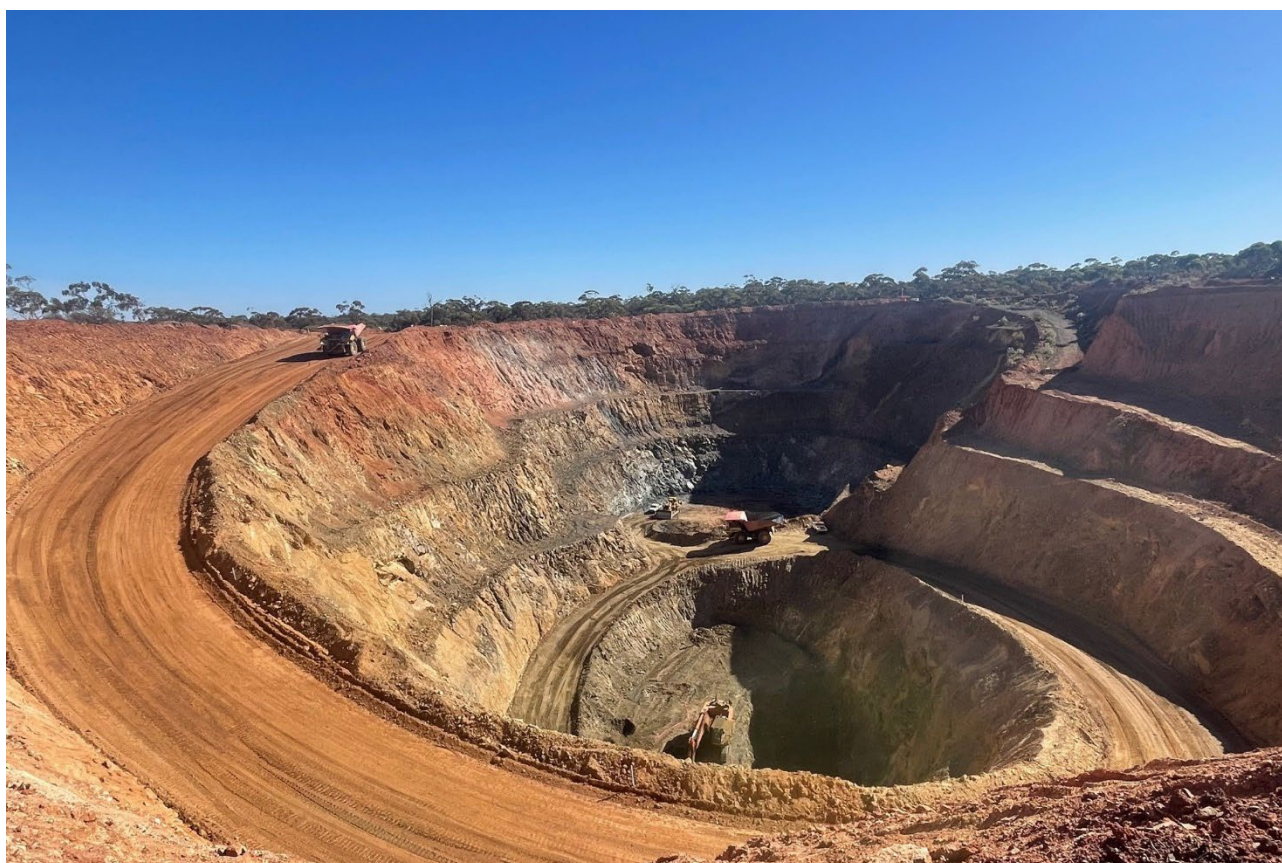
Figure 4: Mining the Newhaven pit at Phillips Find