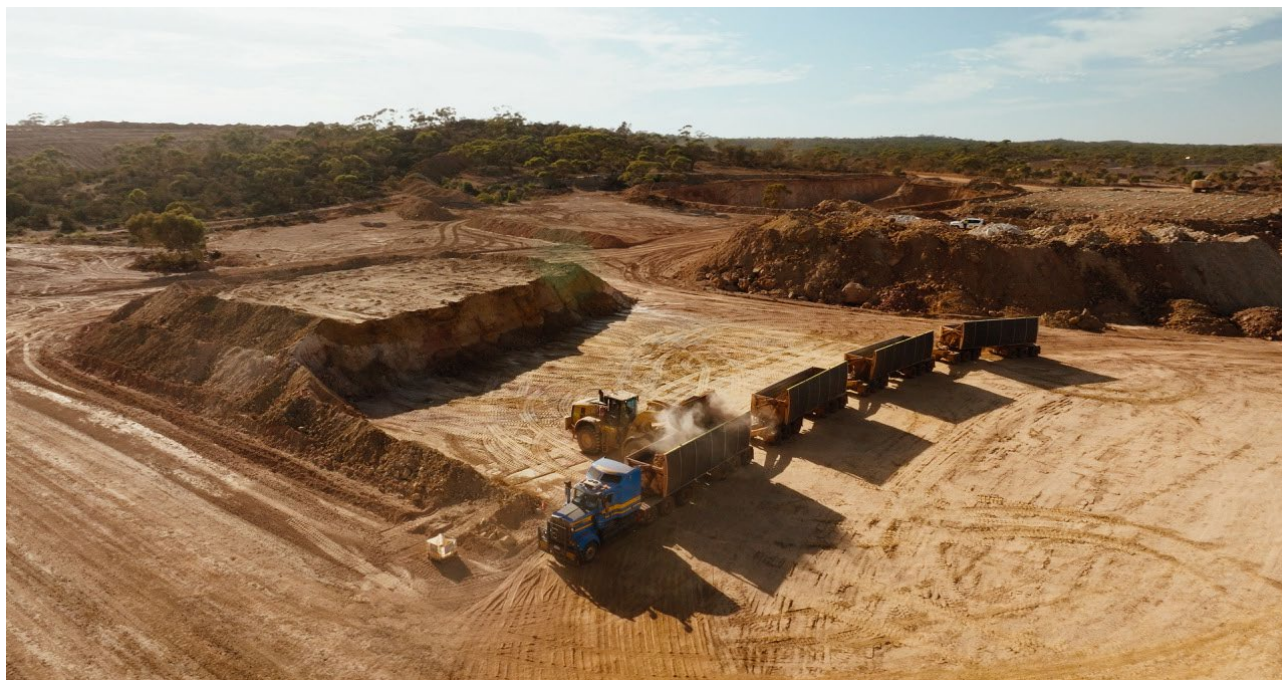
Figure 3: Loading ore at Boorara to transport to the Paddington Mill