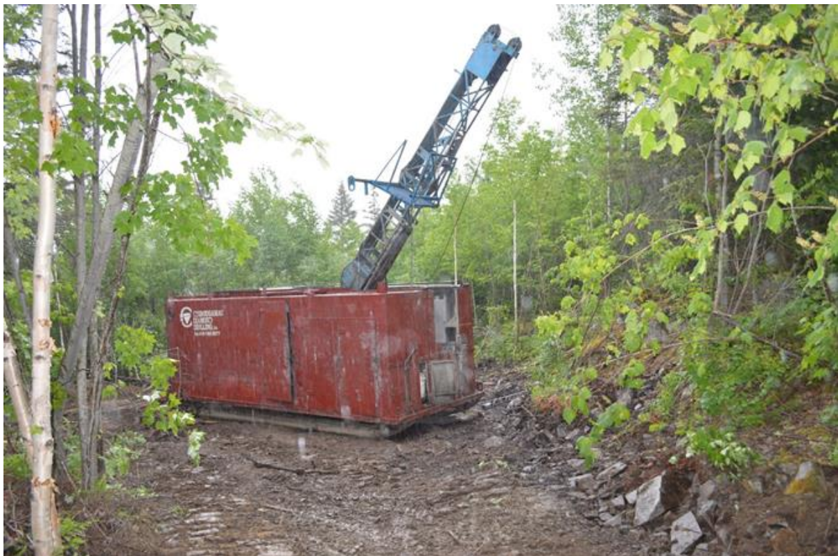
Figure 1: CDD enclosed skid-mounted diamond drilling rig set up on site ZA-20-01