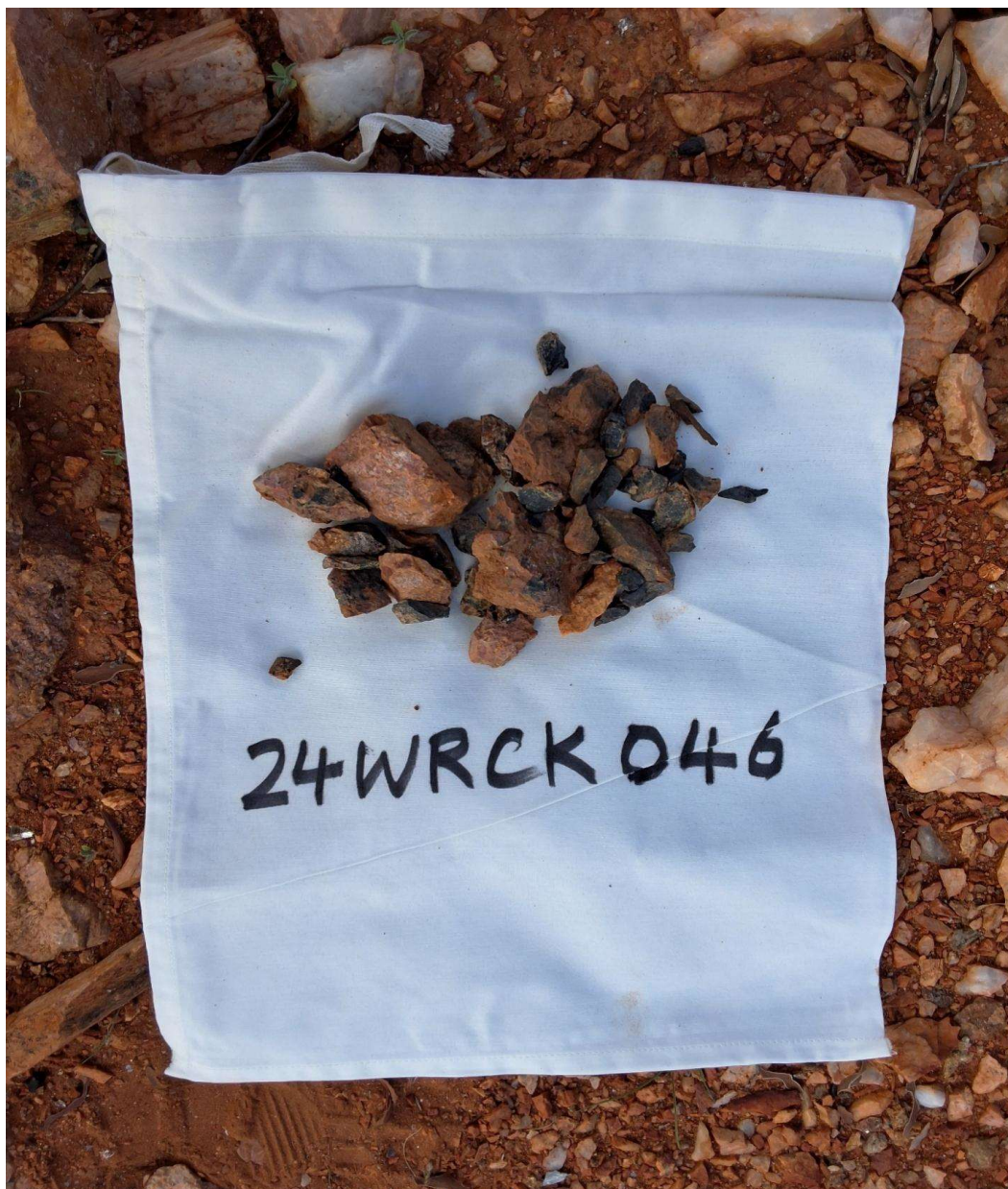
Figure 3: Large black rock fragments chipped directly from the in-situ granitic pegmatite outcrop, Wabli Creek, Gascoyne, W.A (Sample – 24WRCK046).

These latest in-situ results , in addition to the large ovoid intrusive feature (ASX Announcement 28 May 2024), provide a fundamental change in the prospectivity at Wabli Creek.