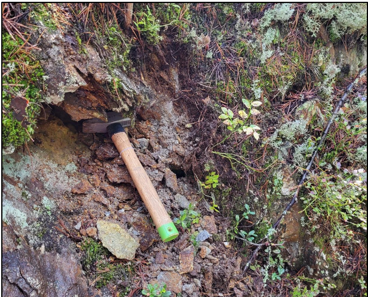
Figure 2. Outcrop of graphitic shale at Loberget

Svererigas Geolokista AB (SGAB) 1 had previously identified a boulder sample a high C (9.3%) value taken from the one sample (BIBC 85014) within the Loberget permit area. Four rock chip samples of basement rock were submitted for multi-element and TGC analysis (Table 1) were taken by WGR with one sample (WGBC011) containing 10% TGC (Figure 2).