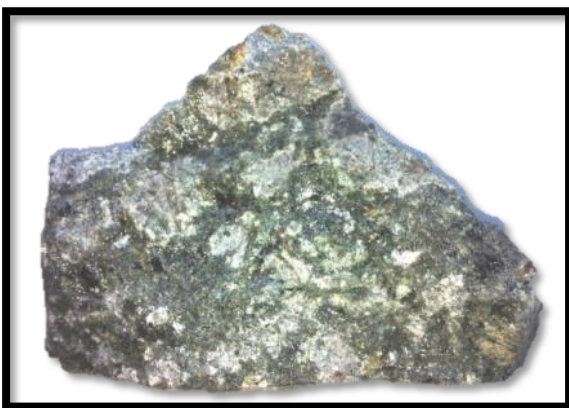
Figure 1a) Brecciated Dacitic Porphyry with disseminated chalcopyrite and chalcocite from the base of the Carmelita workings (~50m below surface) on the eastern edge of Target 1.

This drilling will test zones where petrological studies by Helix identified enrichment in the form of Chalcocite overprinting Chalcopyrite (refer to Figure 1a & 1b). This enrichment has the potential to provide a significant up-lift to the overall copper metal content and grade profile at Joshua.