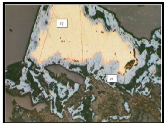
Figure 1b) Thin-section photomicrograph of copper sulphides from the adjacent rock sample.

Sample assayed 3.1% Cu, 0.1g/t Au, 11g/t Ag and 200ppm Mo 1 .