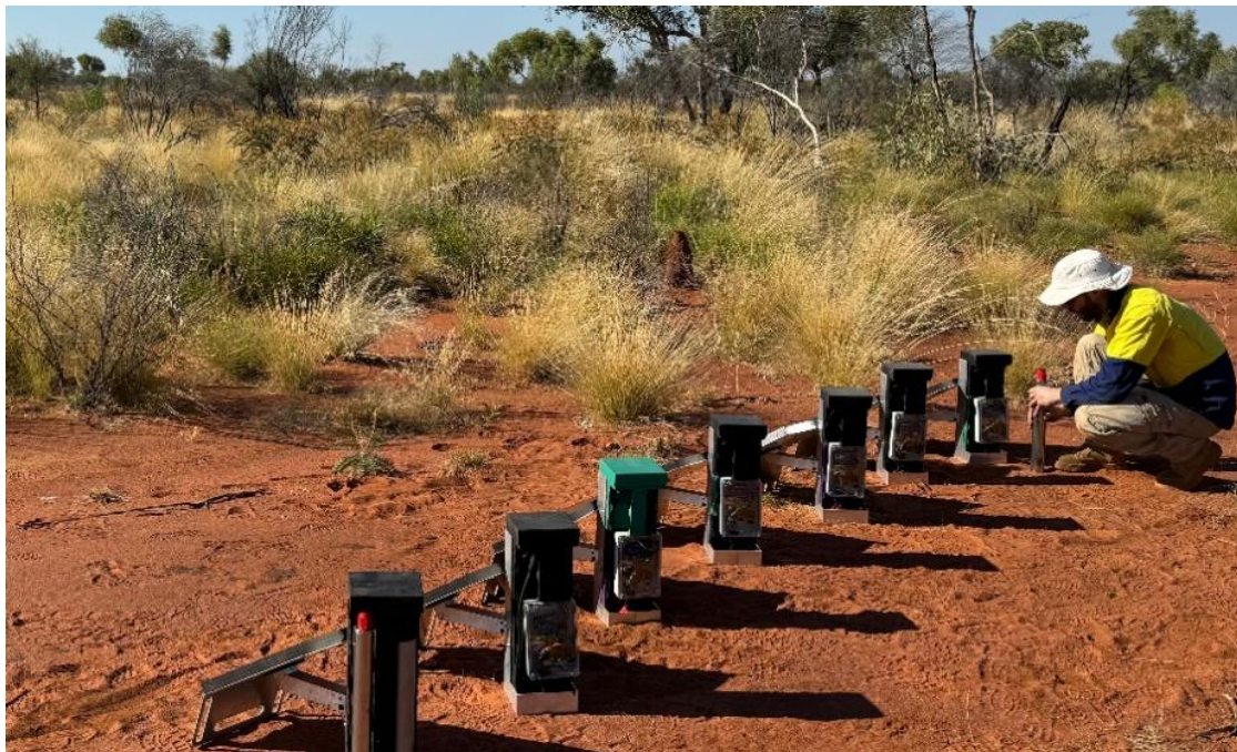
Figure 1: Ambient Noise Tomography sensors being prepared for deployment in the field. The sensors shown would each be spaced approximately 250m apart making the total line or "array" for the survey.

Odyssey Geophysics has developed proprietary hardware and analysis algorithms using ANT. The sensors used by Odyssey Geophysics are made up of the hardware developed by Odyssey Geophysics connected to a small scale 3-component seismometer capable of detecting very low wavelength ambient noise. The data collected by the sensors is then processed by a proprietary software owned by Odyssey Geophysics. The collection sensors can be seen below in Figure 1 prior to deployment.