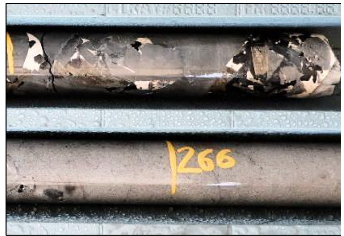
Figure 4. Section of drill core at 265-265.25m containing abundant sphalerite in fragmented (brecciated) mudstone.

The metre sample from 265-266m contained assay values of 1.33% Zn, 22.9 g/t Ag and 0.22% Pb.