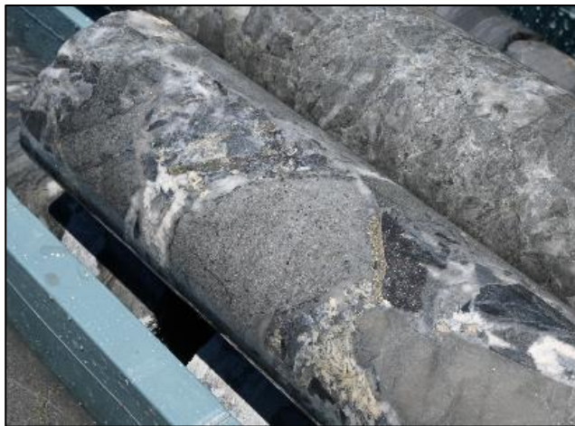
Figure 3. Photo of brecciated sandstones with infill containing sulphides pyrite, sphalerite, and galena.