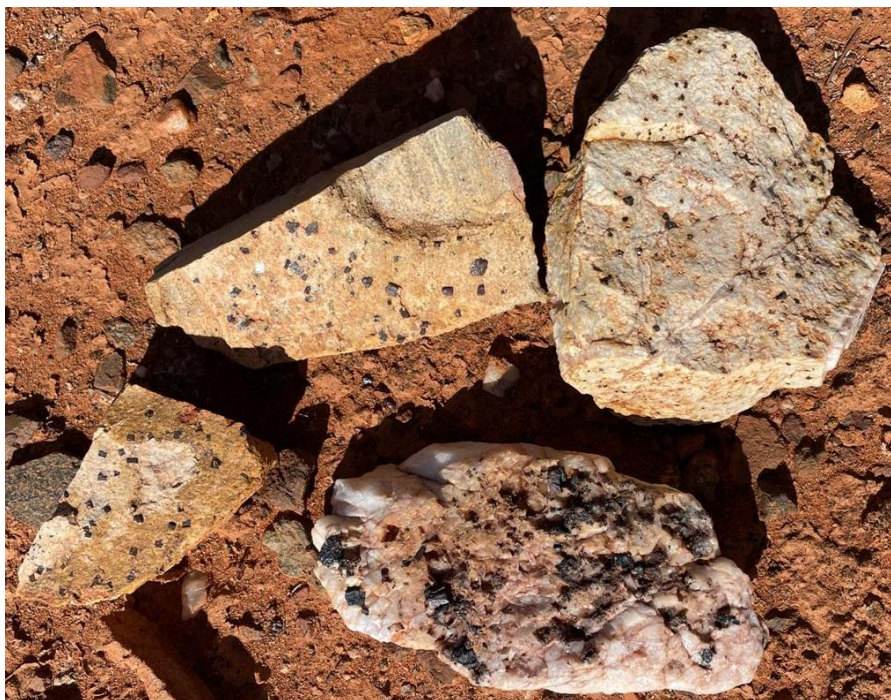
Figure 3: Photograph of granitic porphyry and quartz vein samples with coarse weathered pyrite.

Field work by Silver City geologists 200 m south (and upstream) of the area where nuggets were recovered has revealed outcrops of 0.5-2m wide silicified, feldspar-biotite porphyry dykes that were visually mineralised in places with fine-grained gossanous sulphides (Figure 3). Assays of these rocks returned results of up to 0.19 g/t Au and 0.18 g/t Au (Table 1).