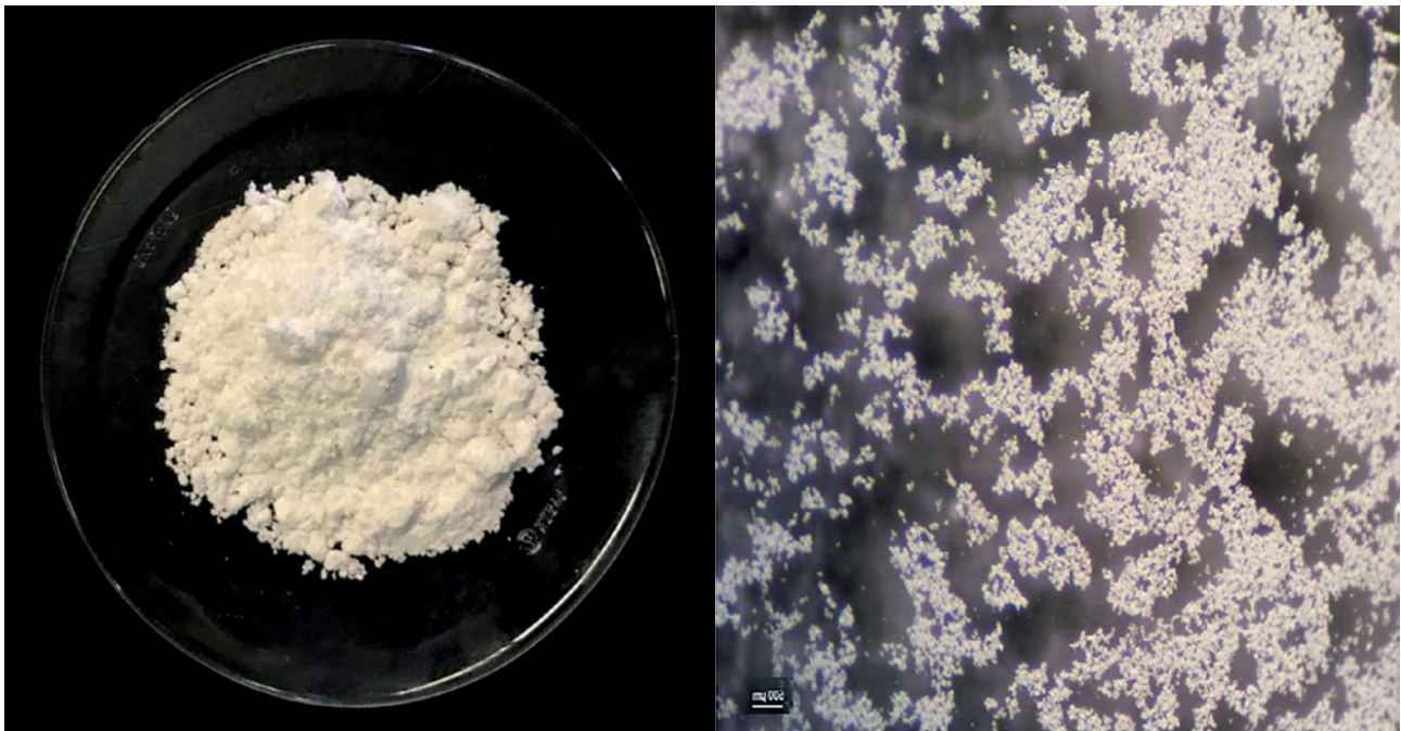
Figure 2: Lithium carbonate samples from Veolia

The initial part of the process uses several crystallization techniques to remove primary contaminants such as calcium in tachyhydrite and calcium chloride. A second part of the process involves simplified and optimised brine polishing to remove remaining boron, calcium and magnesium from the concentrated lithium brine (Table 1). The Project is one of a small number of pre-production lithium projects that has successfully produced high purity lithium carbonate.