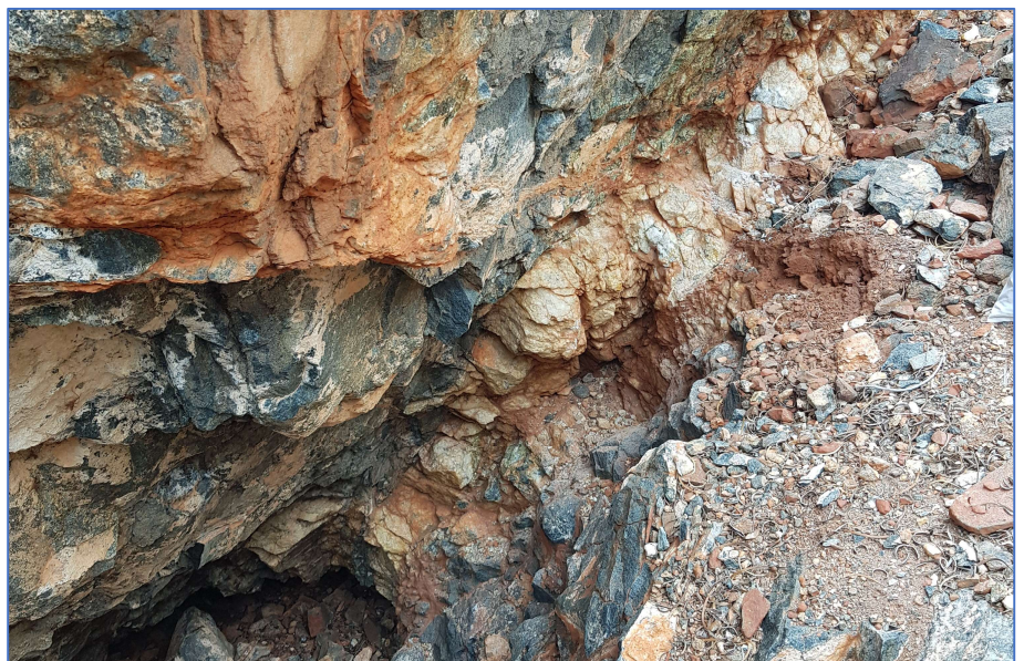
Figure 1. Auriferous quartz vein (sample 24110014; 6.4g/t Au) within sheared mafic hostrock, exposed in shallow open stope.