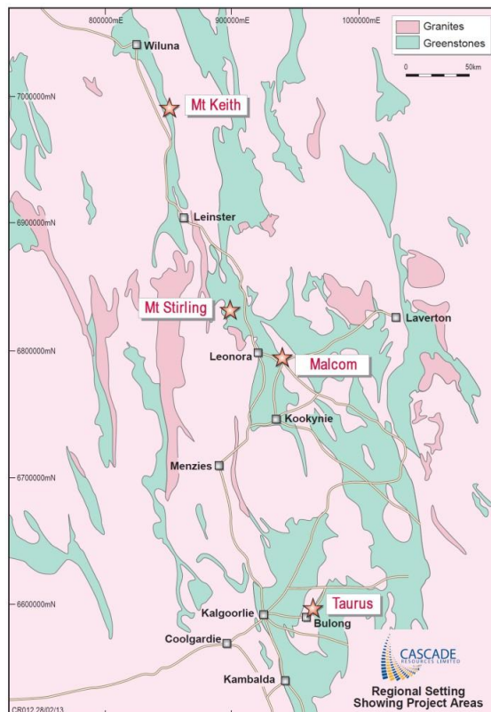
Figure 1: Location of Projects - Goldfields Region Western Australia

Torian has acquired options over 11 gold prospects in the goldfields region of Western Australia that comprise 4 key projects being the Taurus Project, the Mt Stirling Project, the Mt Keith Project and the Malcolm Project.