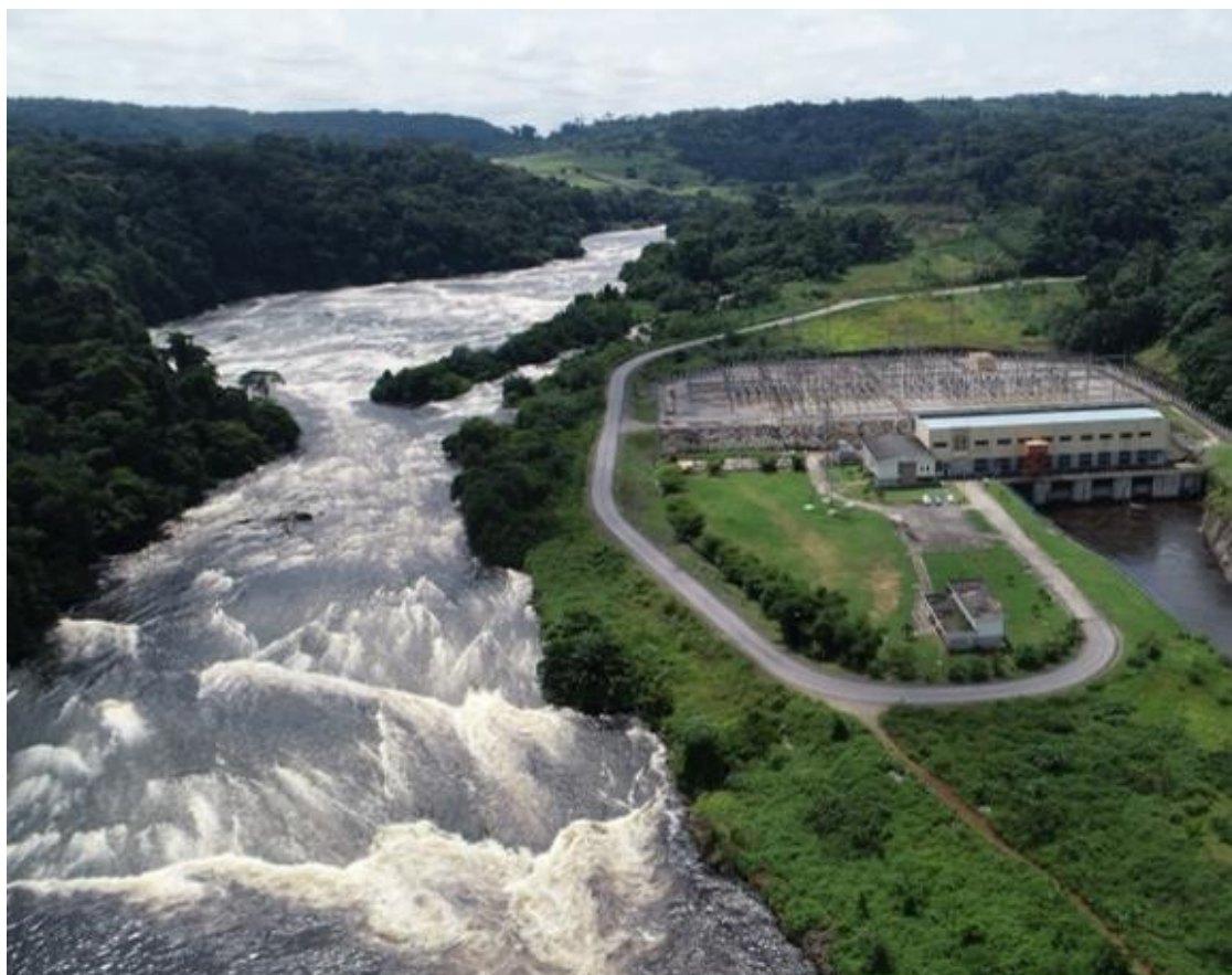
Figure 6: Grand Poubara, Dam (top) and Power Station (bottom)