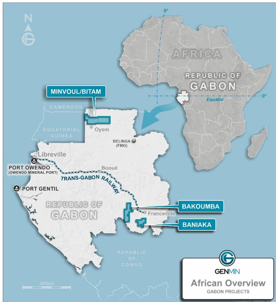
Figure 1: Location map of Genmin's iron ore projects in Gabon, west Central Africa

Genmin's flagship project, Baniaka, is at feasibility stage with defined JORC Code (2012 Edition) compliant Mineral Resources and is favourably situated adjacent to existing and operating bulk commodity transport and renewable energy infrastructure.