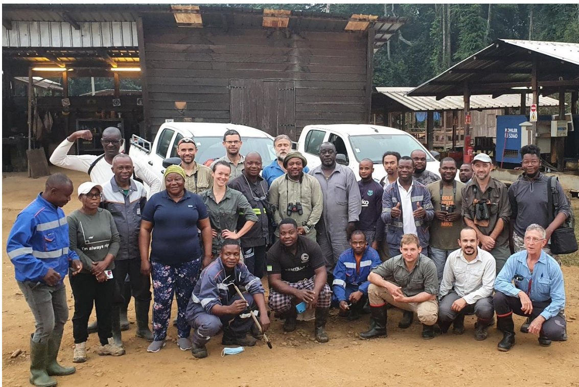
Figure 5: FFMES team at Tsengué Base Camp during the dry season biodiversity survey for the SEIA