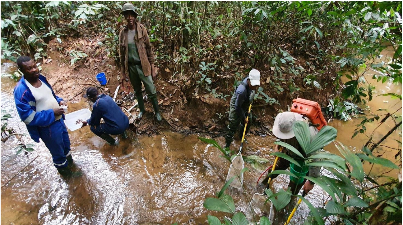
Figure 4: FFMES conduct baseline biodiversity investigations at Baniaka