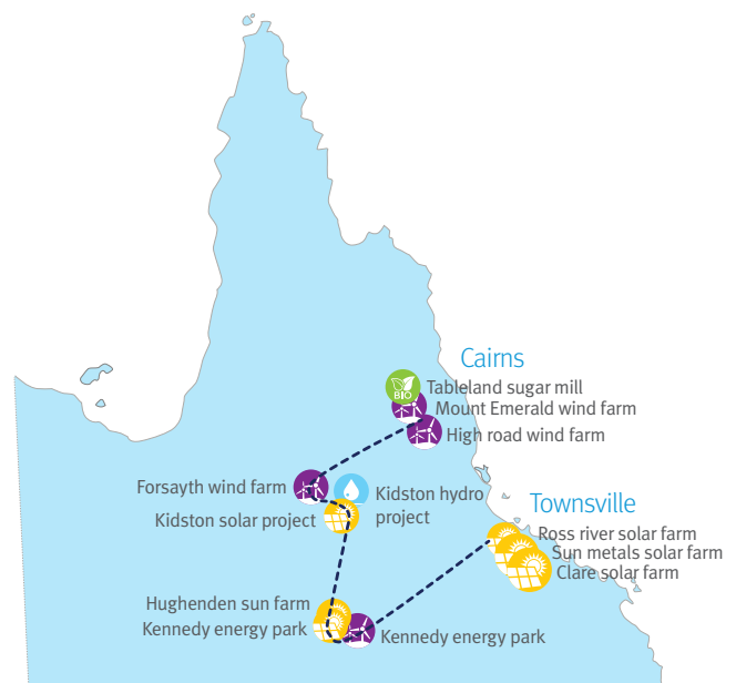
Indicative transmission path in North Queensland

To assess this potential, the Queensland Government will undertake a feasibility study to assess options for the deployment of new hydro-electric and pumped storage generation capacity in the state.