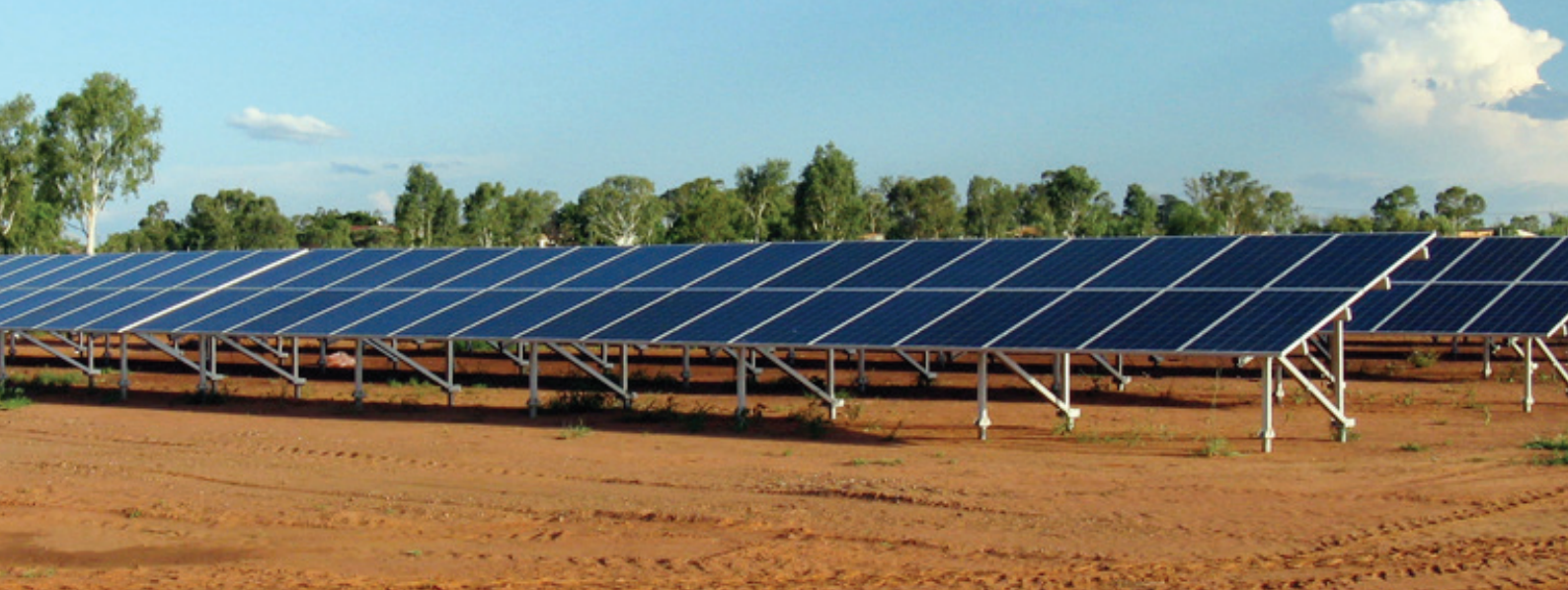
Doomadgee Solar Farm