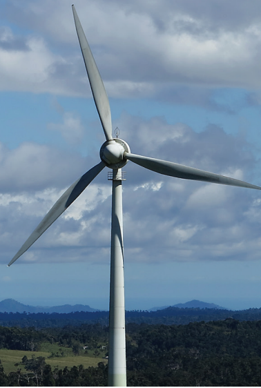
Wind turbine in Atherton Tablelands