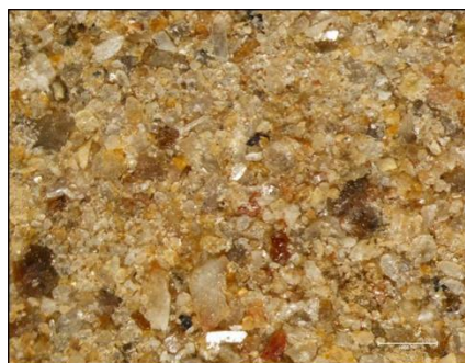
Non-magnetic Concentrate (very low REE content) – 73% of mass