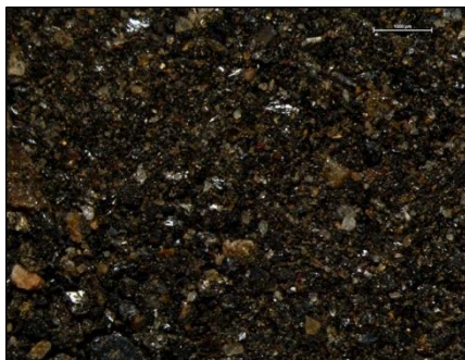
Magnetic Concentrate (high REE content) – 27% of mass

Mineral separation by magnetic methods recovered 87% of the REE minerals into 27% of the mass at a crush size of -0.5mm, whilst mineral separation using gravity methods recovered 76% of the REE minerals into 22.2% of the mass at a crush size of -2mm.