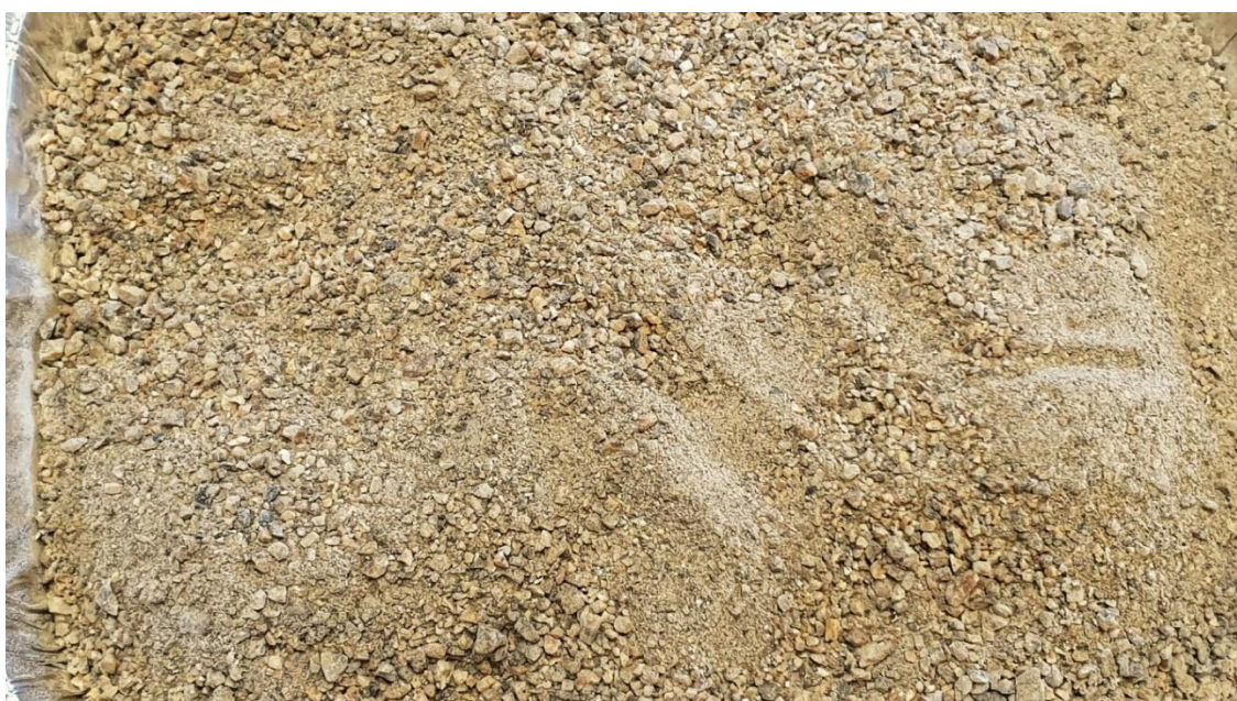
Coarse crushed Laramie REE samples at Nagrom's Facility in Western Australia