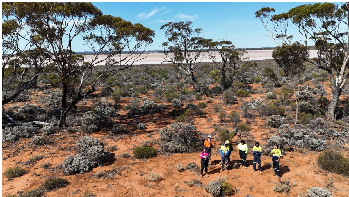
Figure 4 – Participants in the Lake Johnston cultural heritage survey on site, with Lake Johnston in the background

A program of work (PoW) was submitted and approved by the department, and a Cultural Heritage Survey (CHS) was undertaken with the traditional custodians of the Lake Johnston area, the Ngadju. The CHS was successful, resulting in up to 30 drill locations being approved. The approved drillhole locations are positioned to test both lithium and Ni-Cu-PGE potential of the project.