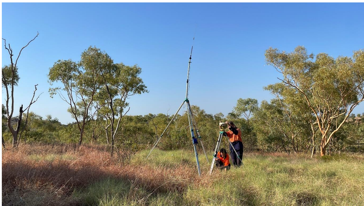
Figure 2 – Collection of gravity survey data underway at Paperbark