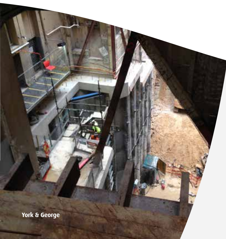
York & George