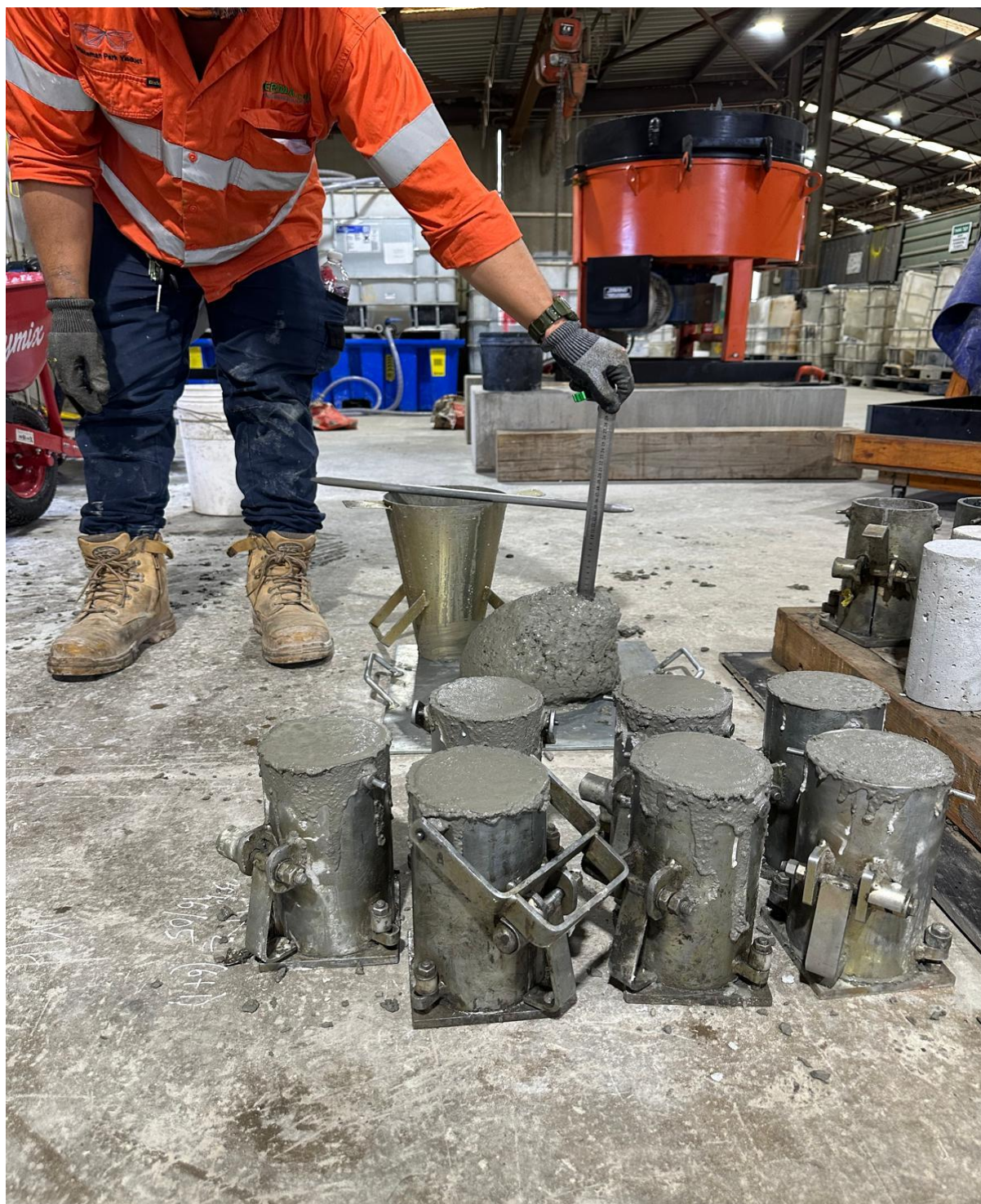
Photo: slump retention testing and comprehensive strength cylinders conducted on 20%, 30% and 40% Portland cement replacement with metakaolin