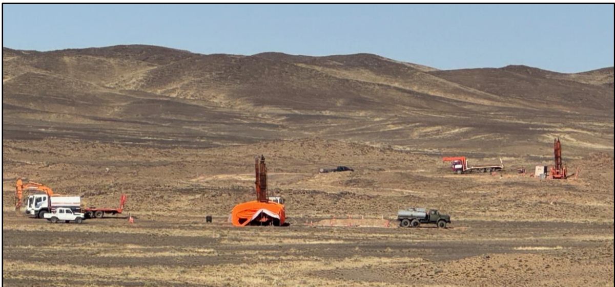
Figure 1: Litho drilling diamond core rigs at Bronze Fox

Woomera is earning an 80% interest in the Bronze Fox Project from Kincora Copper Limited ( ASX: KCC ) by expenditure of US$4m and has to the right to acquire a 100% interest.