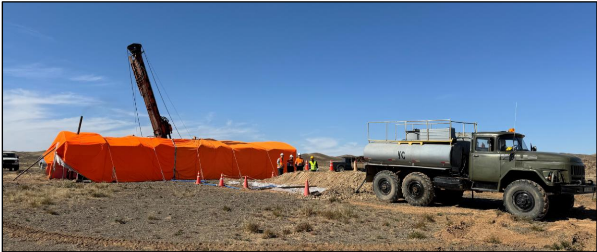
Figure 2: Start of drill hole F109 (planned 900m)