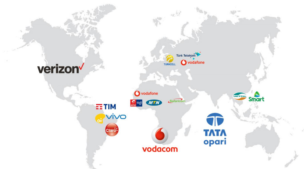
Syntonic's announced mobile operator engagements

Tata Communications ("Tata"), a global telecommunications provider (NSE: TATACOMM) and the flagship telecom arm of the Tata Group, launched, subsequent to the quarter end, its digital commerce platform, opari , and powered by the Syntonic CSP for its sponsored data and data rewards services. The service has been initially launched on the Safaricom network, the leading mobile operator in Kenya with 70% market share and 28 million mobile customers 3 . Syntonic generates revenue based on sponsored data sales to opari's customers, which include content providers, app publishers and brands.