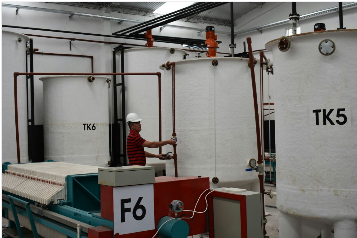
Figure 1. Rincon Lithium Project – Stage 1 pilot plant operational

I would like to congratulate the operations team at this key milestone, and we will continue to progress to deliver on our near-term objectives of producing battery grade LCE product."