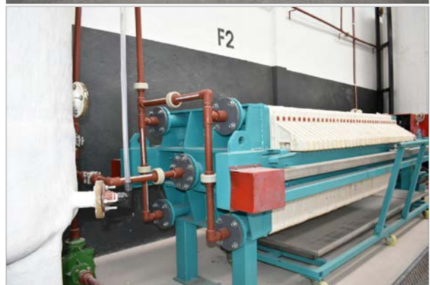
Figures 2-5. Rincon Lithium Project – Stage 1 pilot plant, on-site laboratory and storehouse