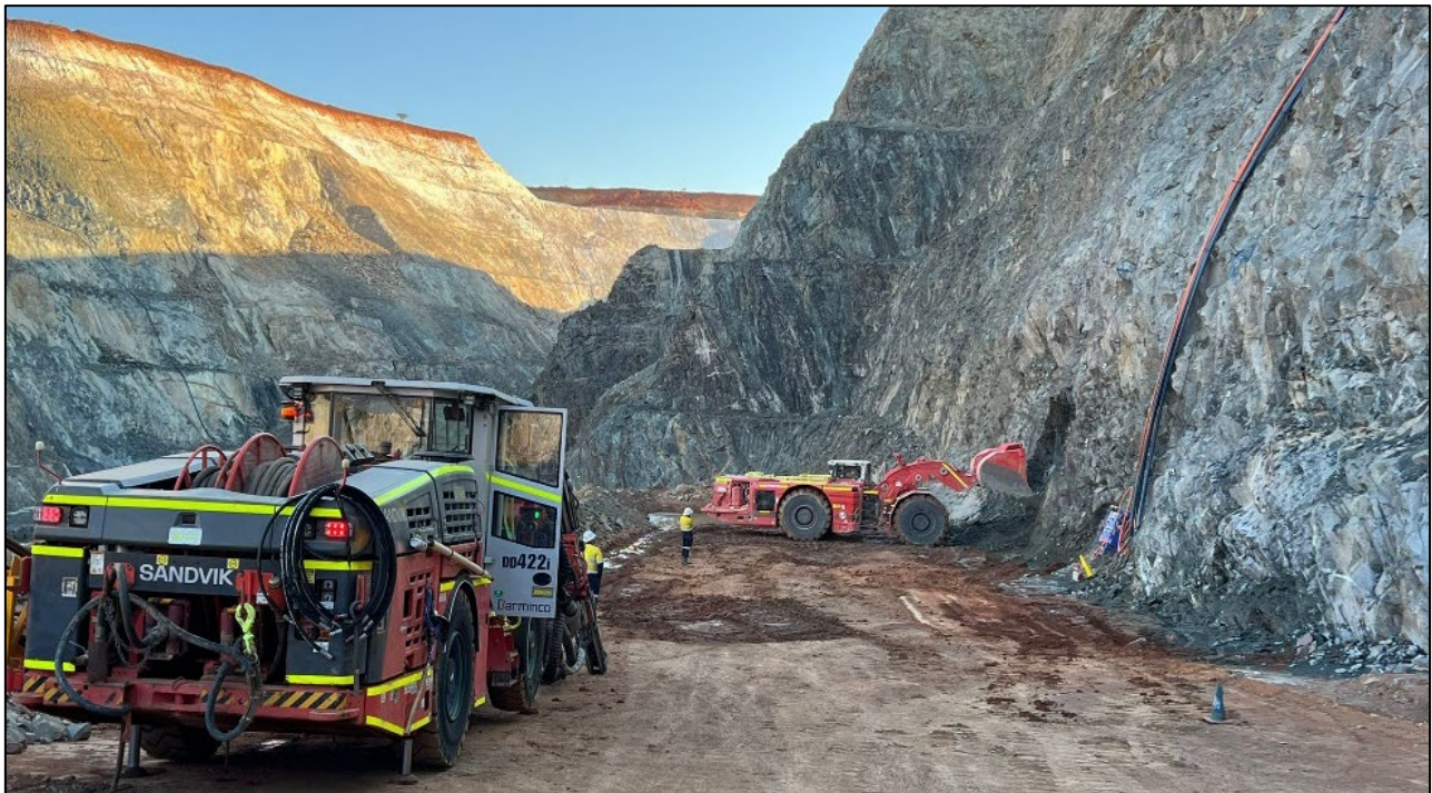
Figure 1: South-east view down the Western Ramp of the Gilbey's Open Pit with a Barmenco Sandvik LH621 underground loader “Bogger” clearing waste from the first portal cut while a Barmenco Sandvik DD422i waits uphill to install mesh and bolt support and to bore the next cut.

Spartan Resources Limited (“ Spartan ” or “ Company ”) (ASX: SPR) is pleased to advise that development of the Exploration Drill Drive, the “Juniper Decline”, has commenced at its 100%-owned Dalgaranga Gold Project (“DGP”) , located in the Murchison region of Western Australia.