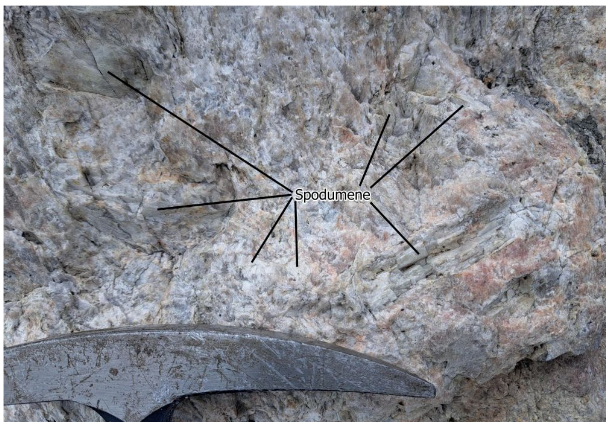
Figure 2: Medium-Coarse Grained Spodumene

In relation to the disclosure of visual occurrences of pegmatite and spodumene, the Company cautions that visual occurrences should never be considered a proxy or substitute for laboratory analysis. Laboratory assay results of the rocks sampled are required to confirm the grade of visual occurrences of pegmatite reported in the preliminary samples taken. The Company will update the market when laboratory analytical results become available.