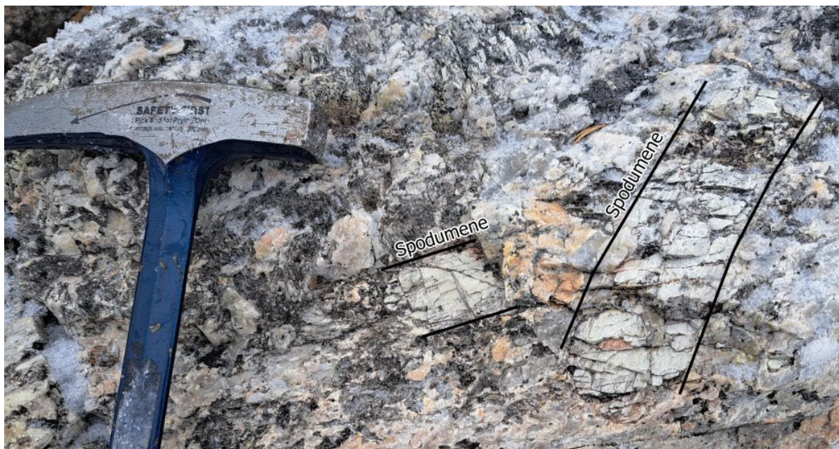
Figure 1: Coarse Spodumene Crystals