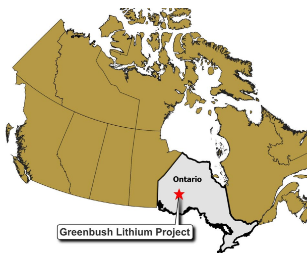
Midas Minerals Greenbush Project Location Map

Greenbush Lithium Project: 102km 2 of tenements located proximal to infrastructure, with little outcrop and no historic drilling. A 15m by 30m spodumene bearing pegmatite outcrop was discovered in 1955 on the northeast shore of a lake and sampled by the Ontario Geological Survey (OGS) in 1965. The OGS chip was sampled across the full 15m width of the spodumene pegmatite outcrop, with results averaging 1.25% Li 2 O. Refer ASX announcement dated 13 February 2023.