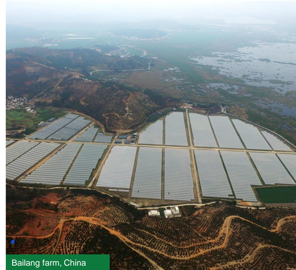
Bailang farm, China